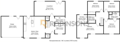
Floorplan produced by Woodside Photography Floorplan is for illustration purposes only and all measurements are approximate