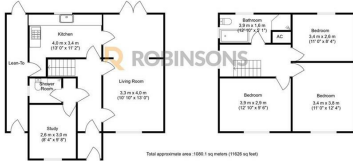
Floor plan produced by Viewdata Photography Floorplan is for illustrative purposes only and all measurements are approximate.