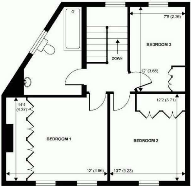
FIRST FLOOR abt 637 SQFT (EXTERNAL)