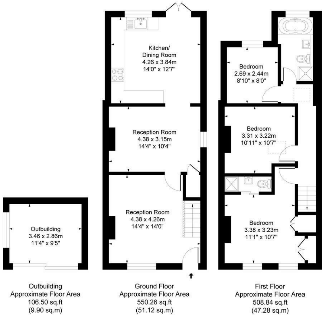
Illustration for identification purposes only, measurements are approximate, not to scale. Produced By Esjay Property Marketing