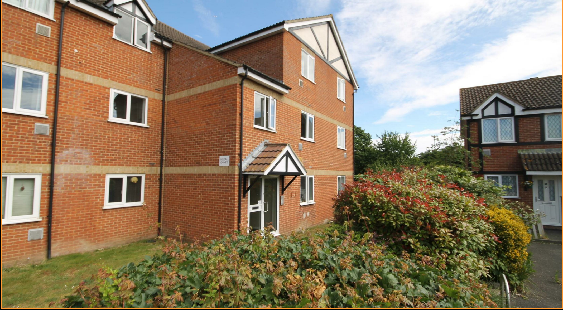
Flat 6 4 Primrose Close, Wallington, SM6 7HJ