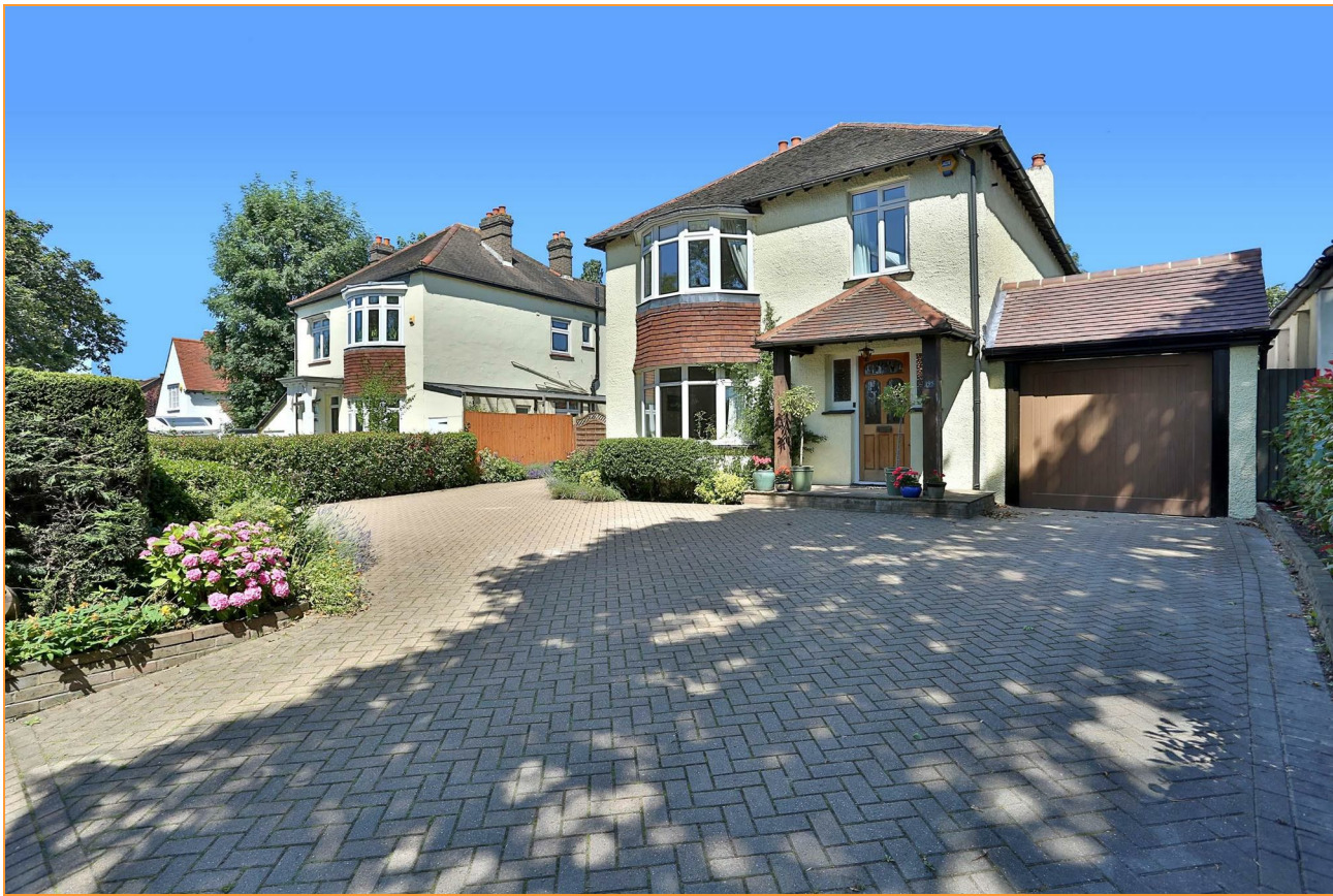
195 Woodcote Road SOUTH WALLINGTON, SM6 0QQ