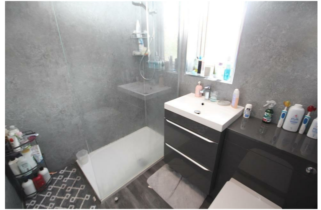
Ground Floor Approx. 49.5 sq. metres (532.3 sq. feet)