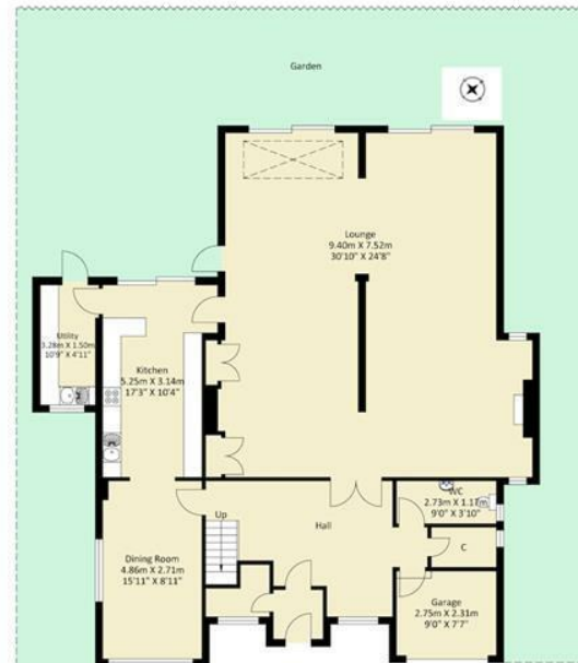
Ground Floor Approximate Floor Area 1553.23 sq. ft (144.30 sq.m)