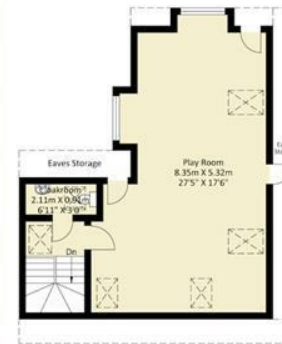
Second Floor Approximate Floor Area 499.44 sq. ft (46.40 sq.m)

Approximate Gross Internal Area = 313.0 sq m / 3369.09 sq ft Illustration for identification purposes only, measurements are approximate, not to scale.