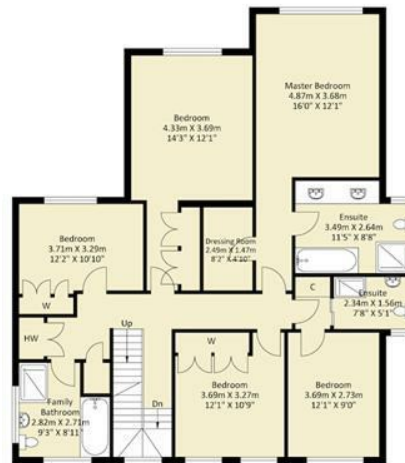
First Floor Approximate Floor Area 1316.42 sq. ft (122.30 sq.m)