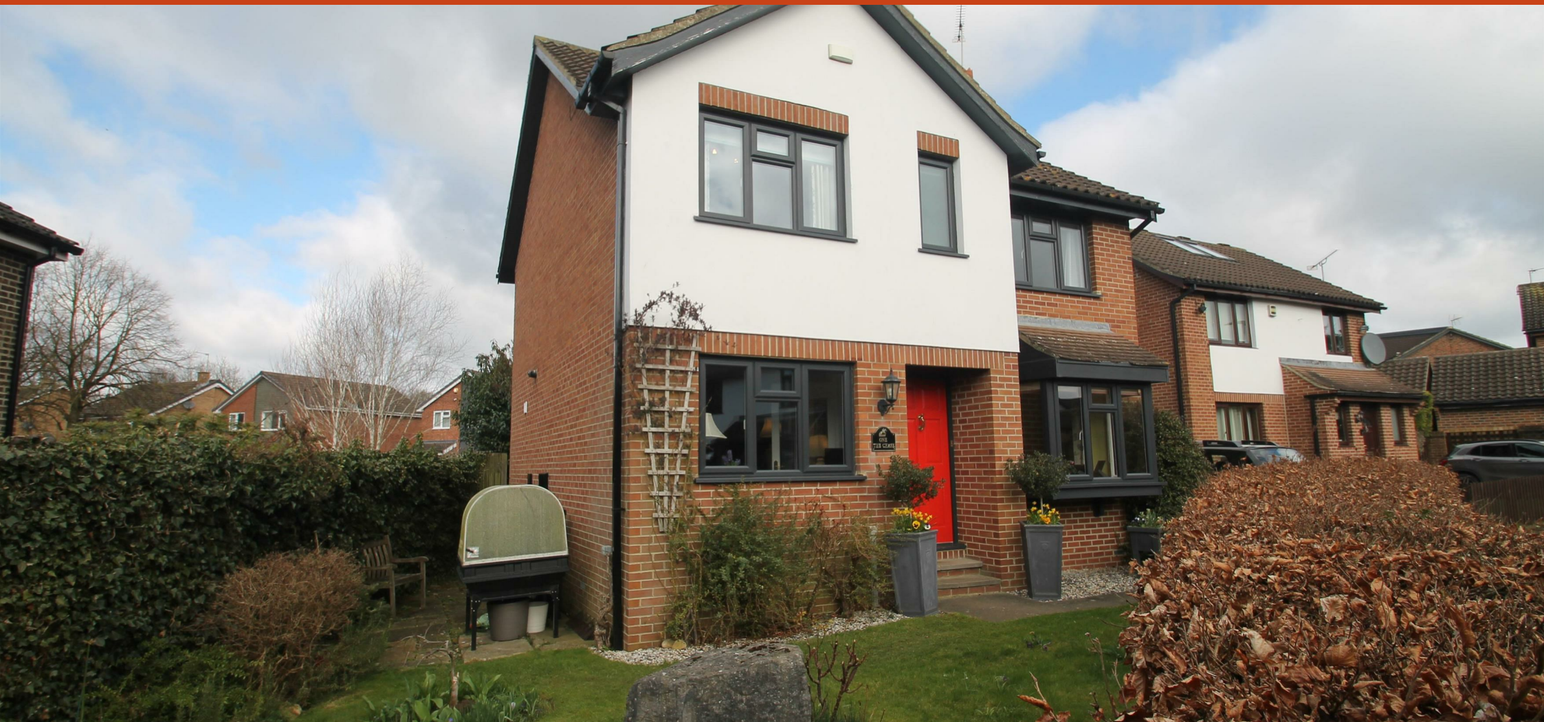
THE CHASE £479,950