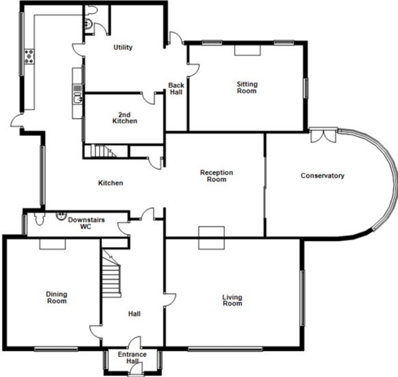
First Floor Approx. 166.3 sq. metres (1789.6 sq. feet)