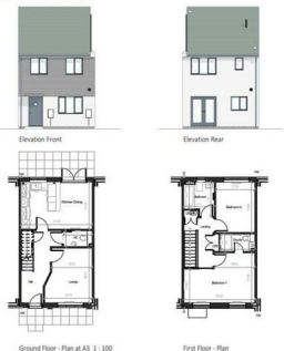
HOUSE TYPE D2 - SHORE

The Shore offers car parking for 2 vehicles to the front of the property. The build is set to finish mid-2026.