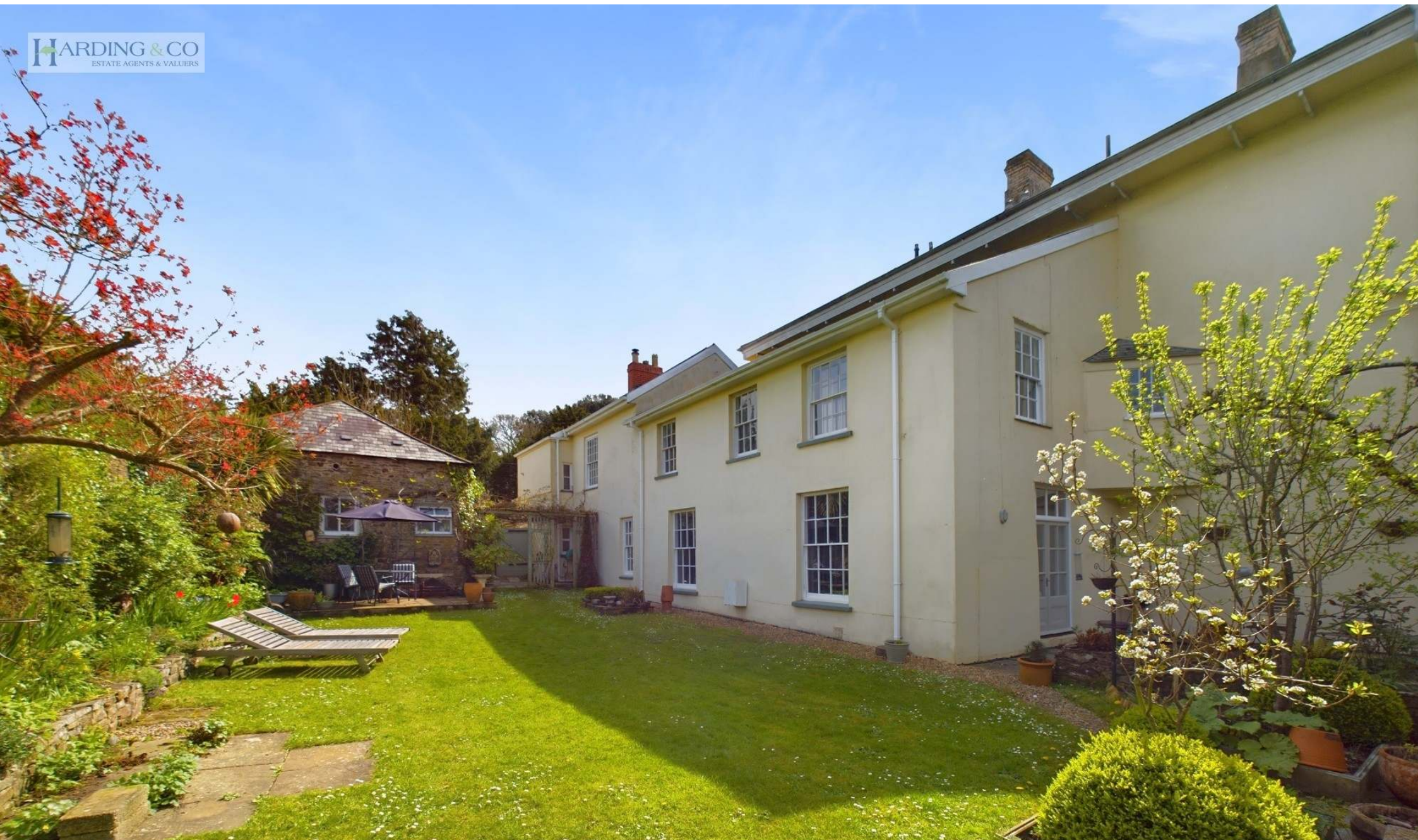
The Old Courtyard Limers Lane, Northam, Bideford, Devon EX39 2RG