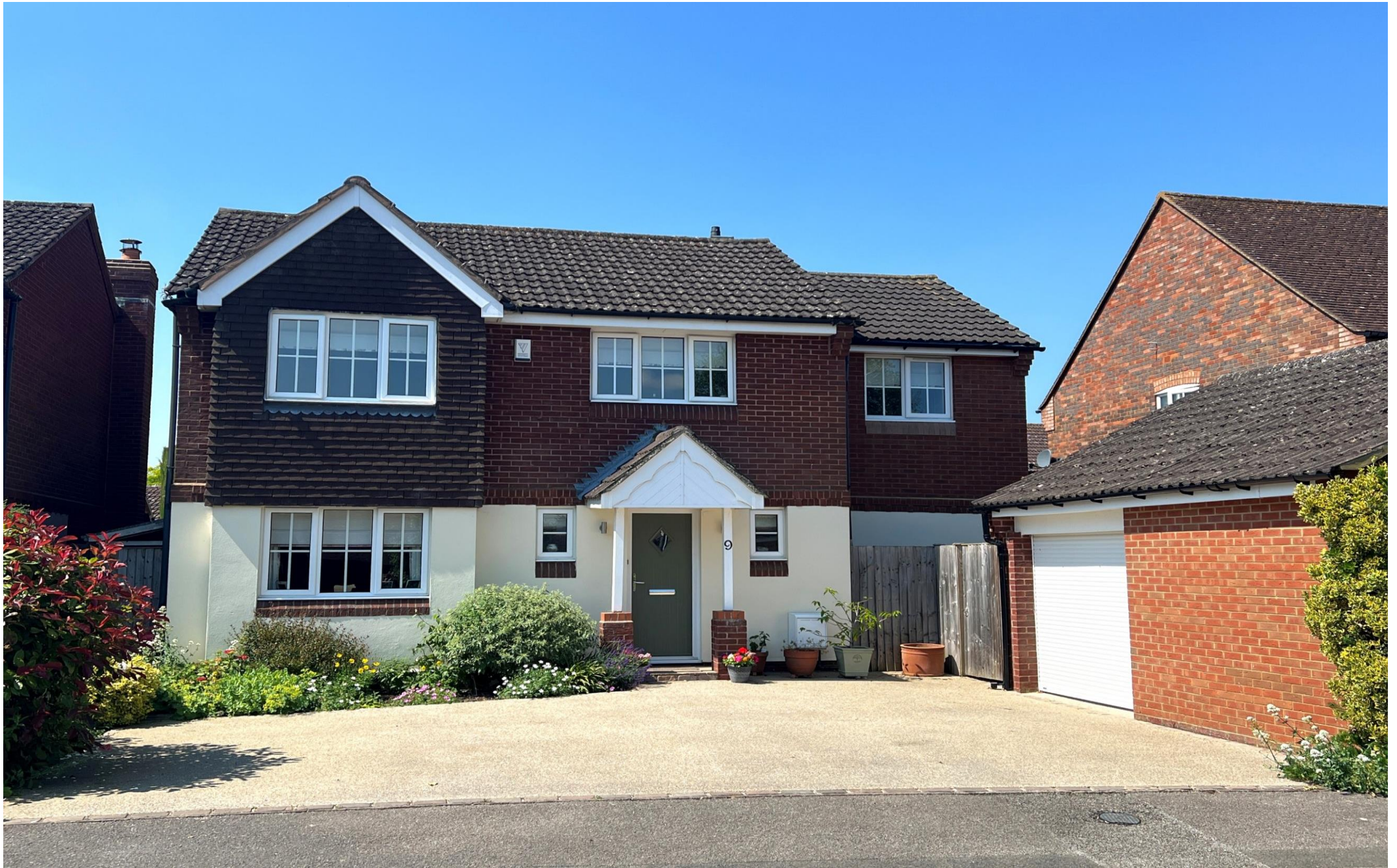
The Glebe, Weston Turville, Buckinghamshire, HP22 5ST