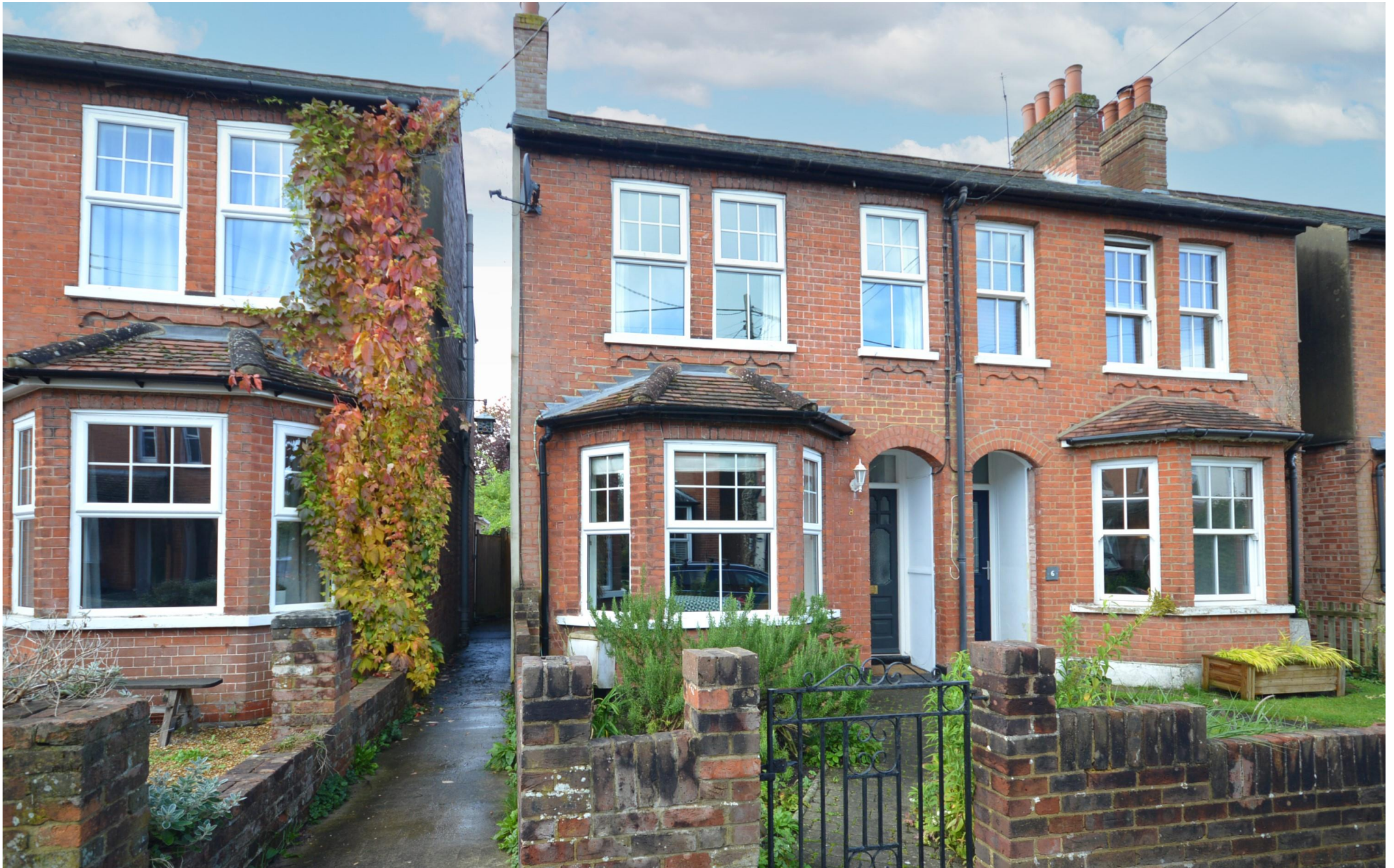
Nightingale Road, Wendover Buckinghamshire, HP22 6JX