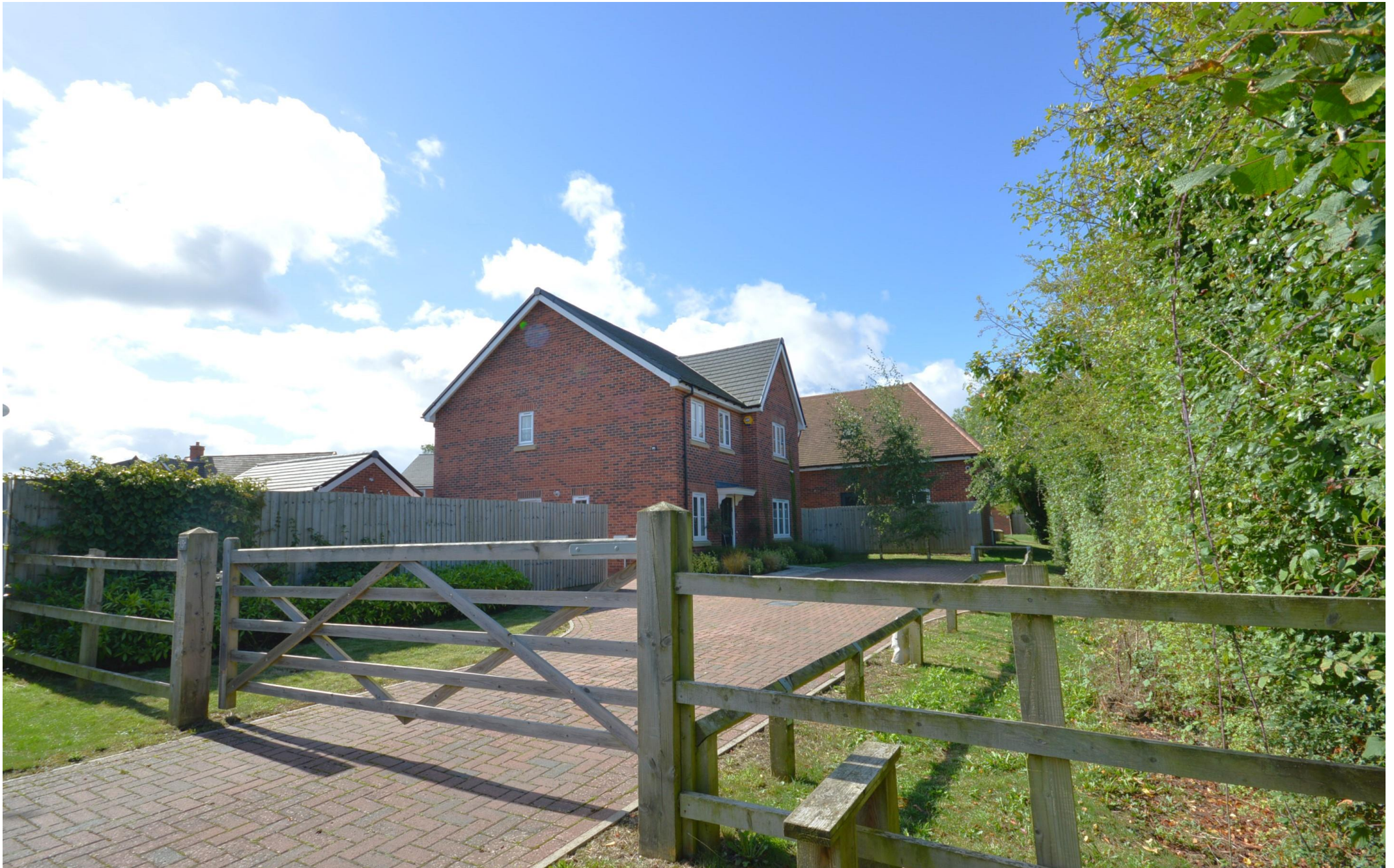
Brackley Close, Aston Clinton, Buckinghamshire HP22 5JQ