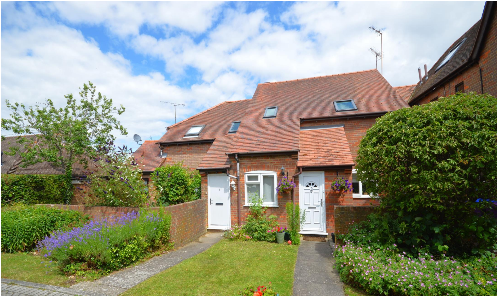
2 Chiltern Court, Wendover, Buckinghamshire, HP22 6EP