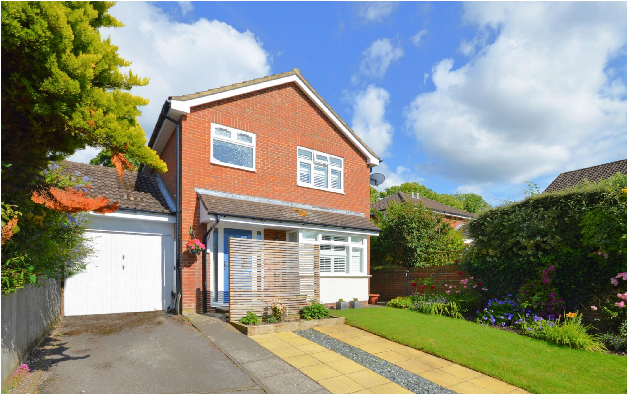
Wendover Heights, Wendover, Buckinghamshire HP22 6PH