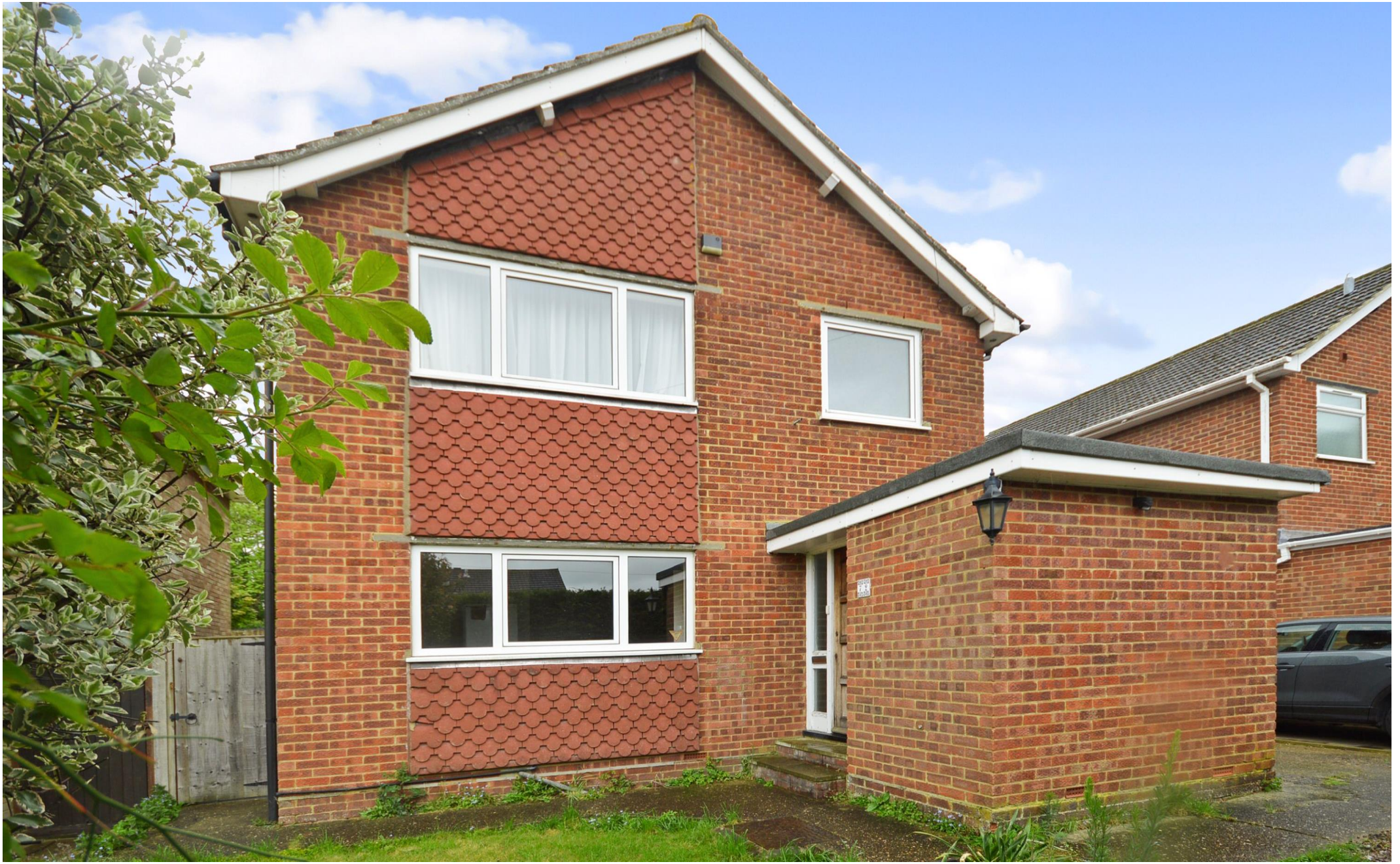
Bryants Acre, Wendover, Buckinghamshire, HP22 6LA