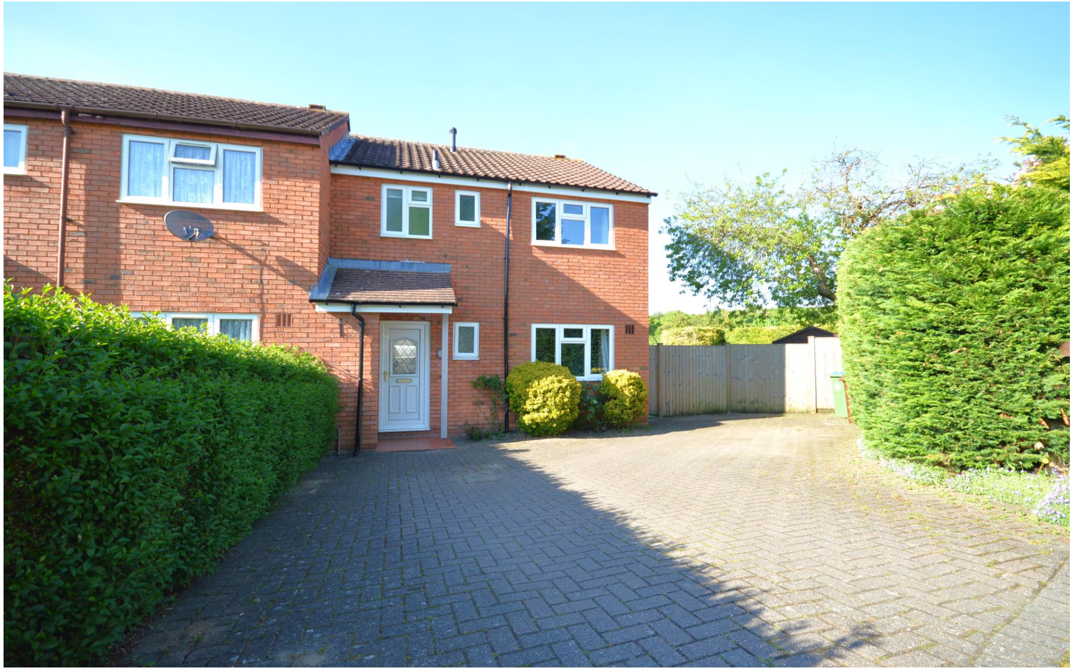
Compton Road, Wendover, Buckinghamshire, HP22 6HR