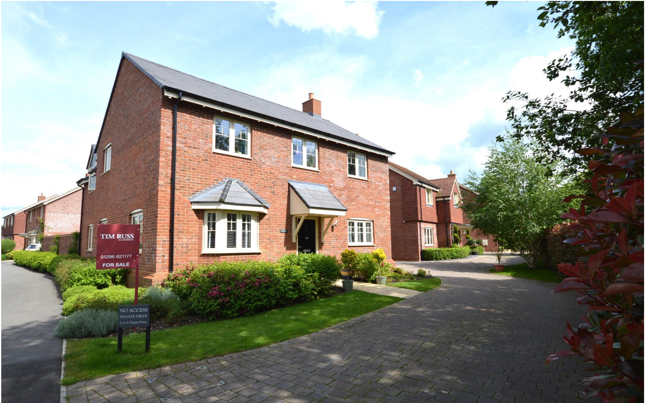
Chapel Drive, Aston Clinton, Buckinghamshire HP22 5EN