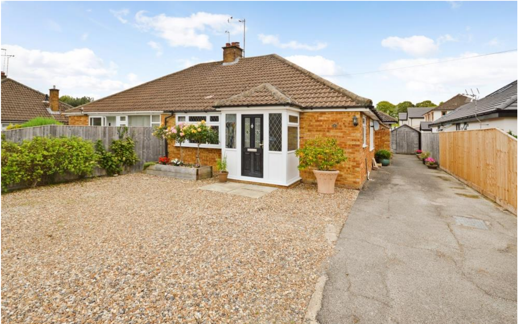
Thornton Crescent, Wendover Buckinghamshire, HP22 6DG