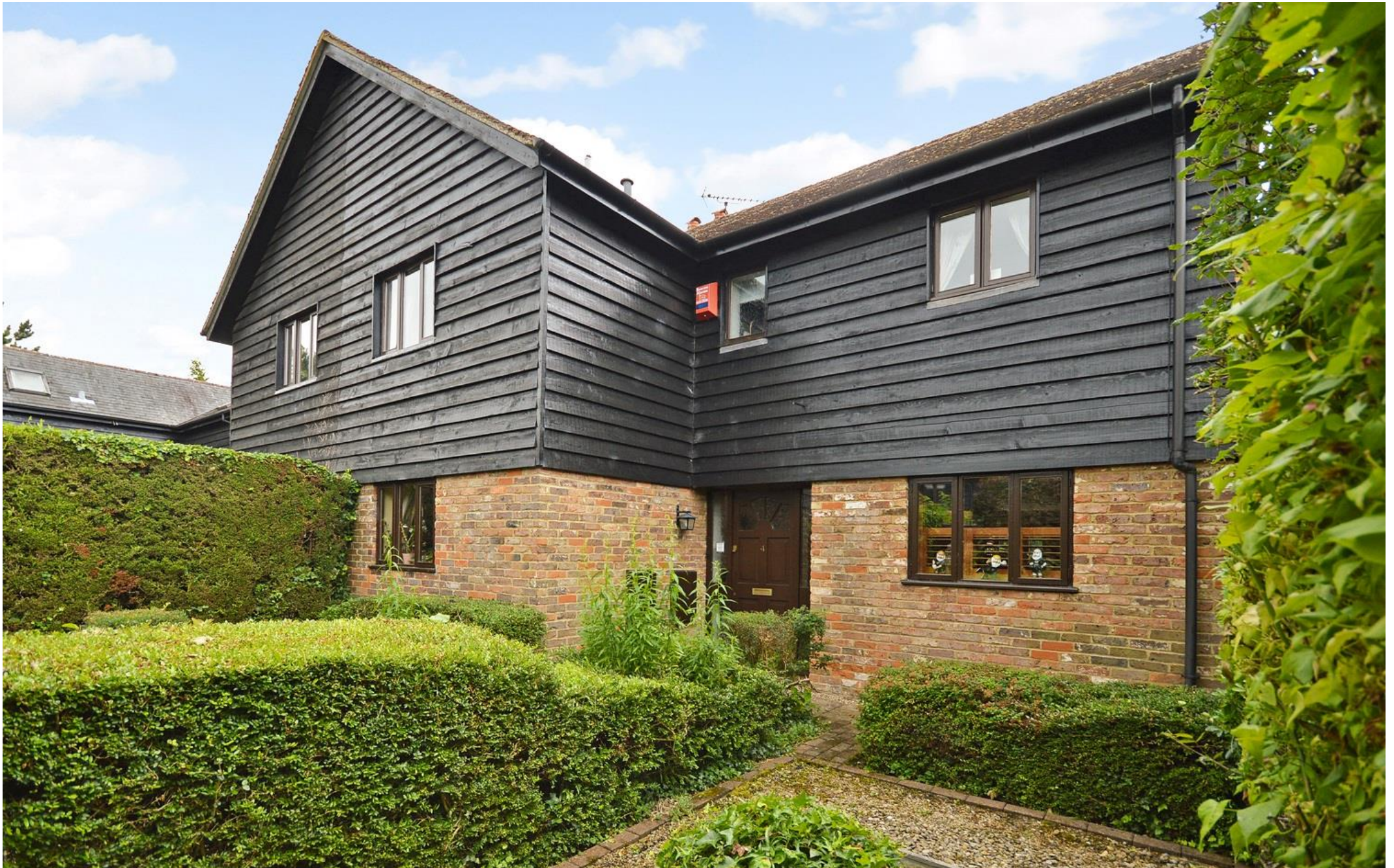
West End Place, Weston Turville, Buckinghamshire, HP22 5QZ