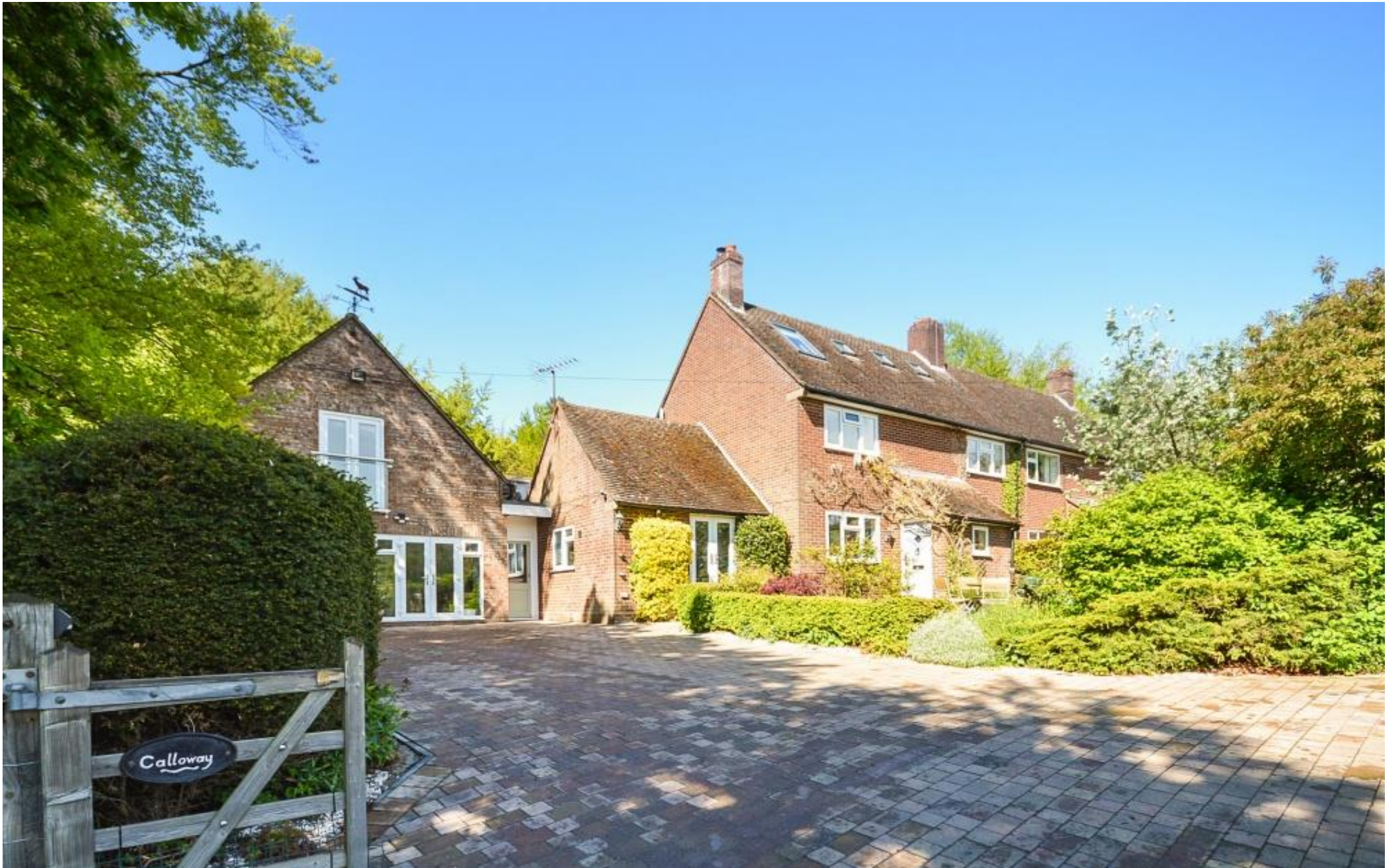
Calloway, Hale Lane, Wendover, Bucks, HP22 6QP