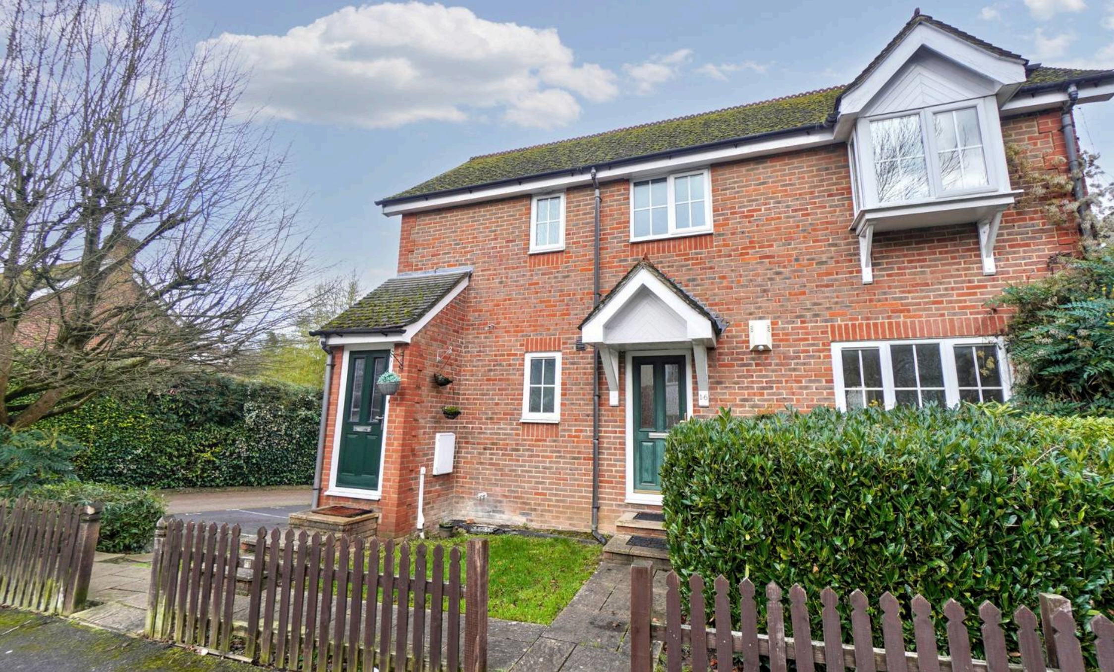
Flat 16, Langston Court Gallows Lane, High Wycombe, HP12 4BP £220,000