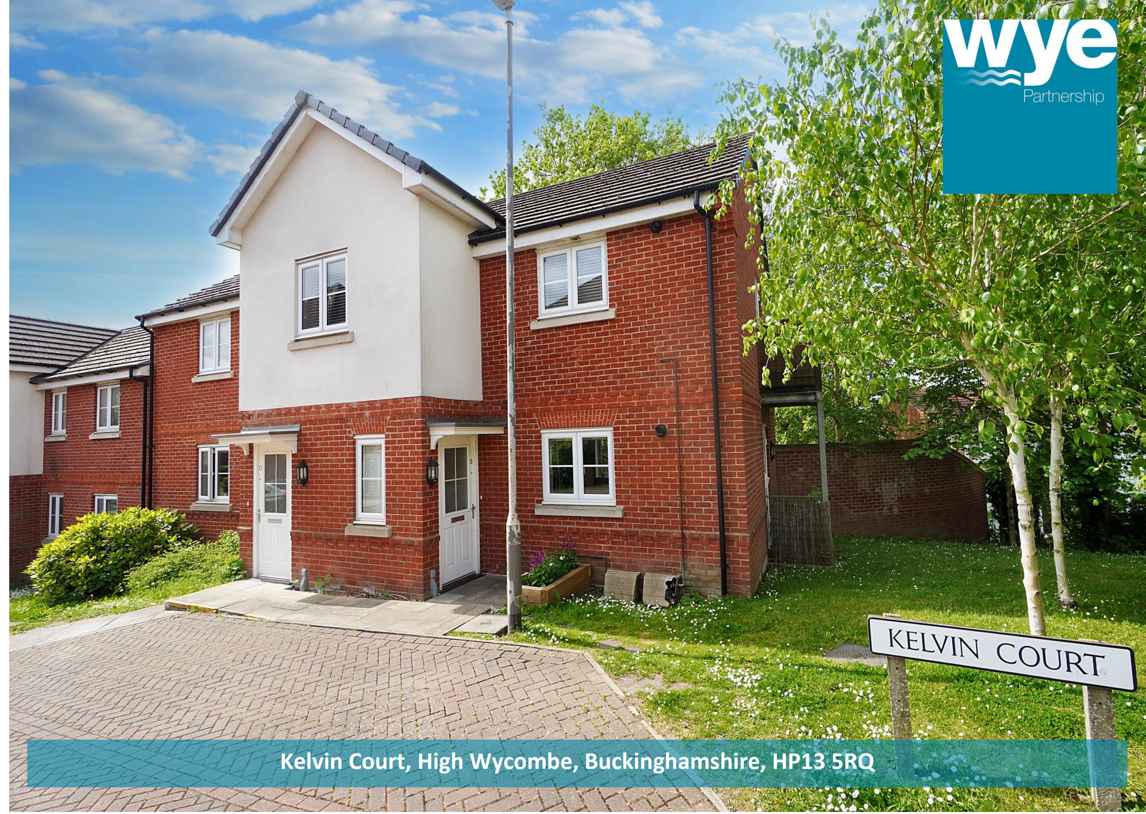
Kelvin Court, High Wycombe, Buckinghamshire, HP13 5RQ