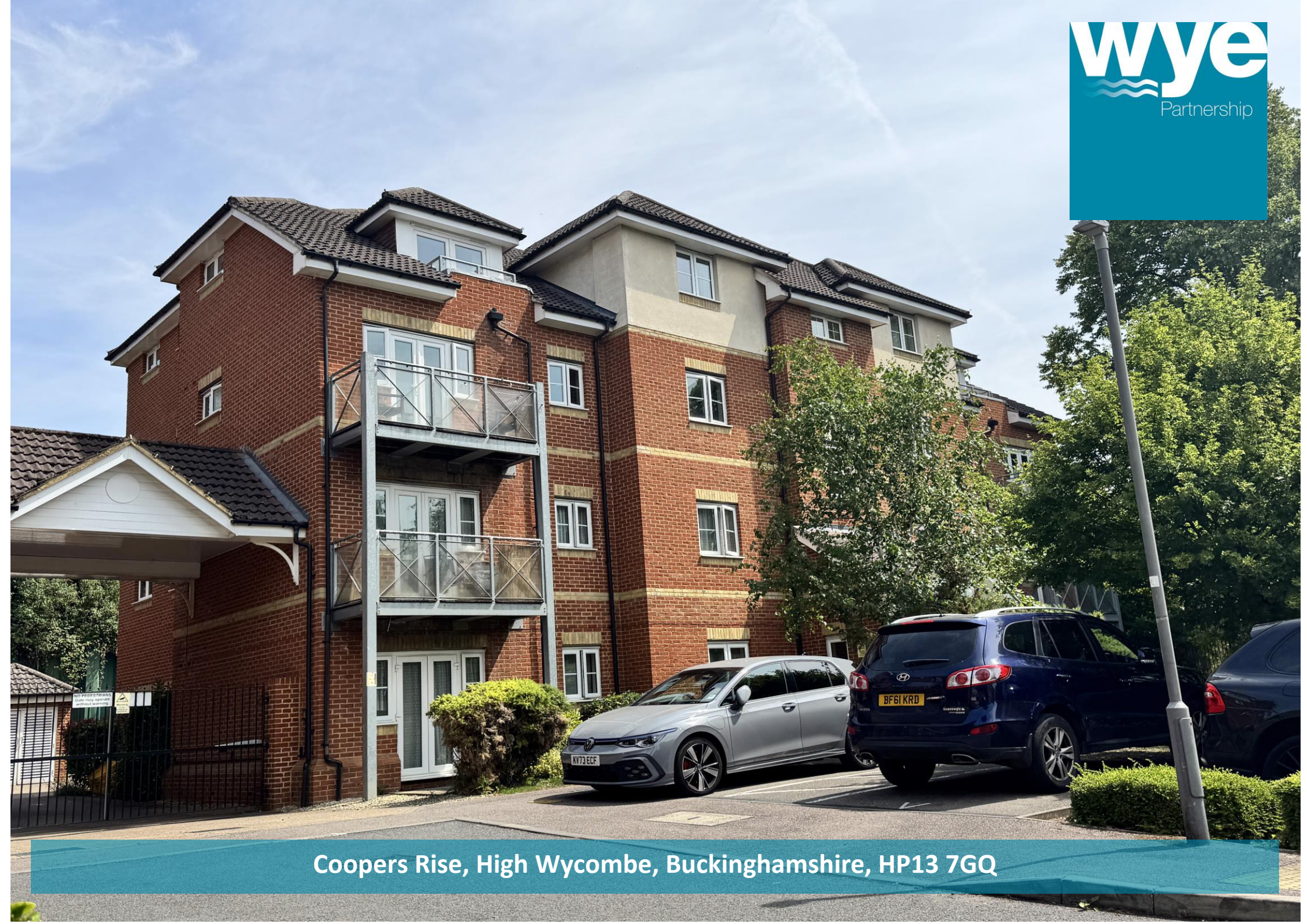
Coopers Rise, High Wycombe, Buckinghamshire, HP13 7GQ