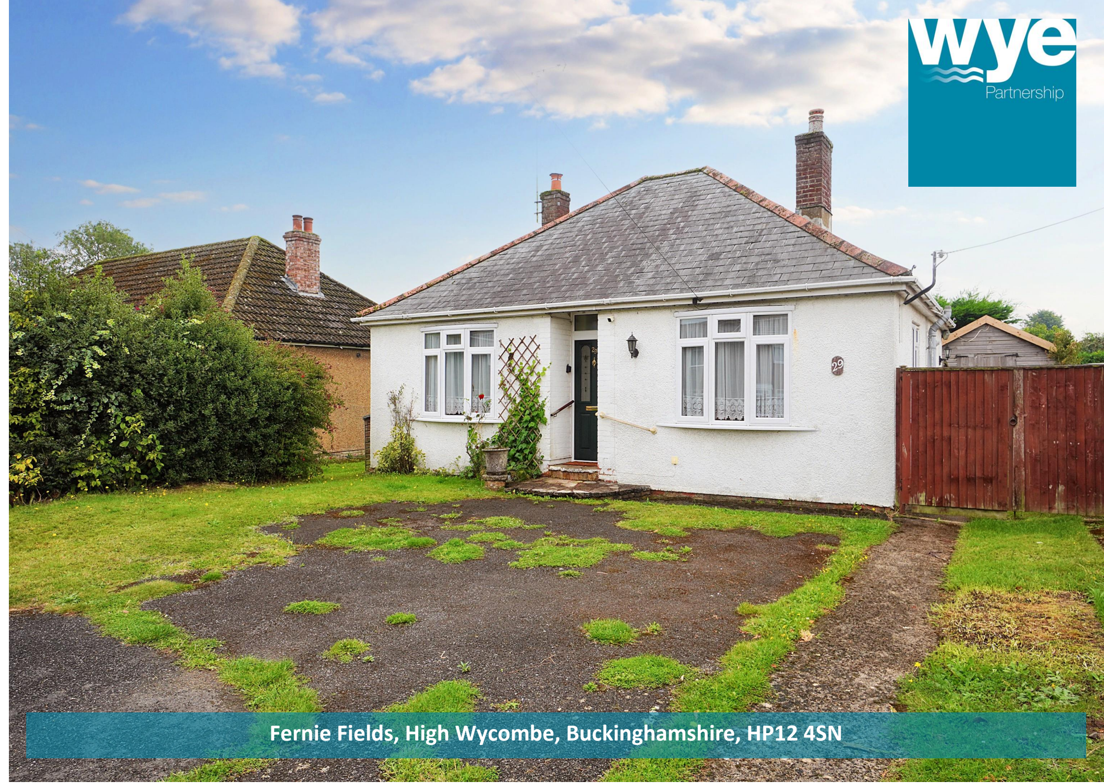
Fernie Fields, High Wycombe, Buckinghamshire, HP12 4SN