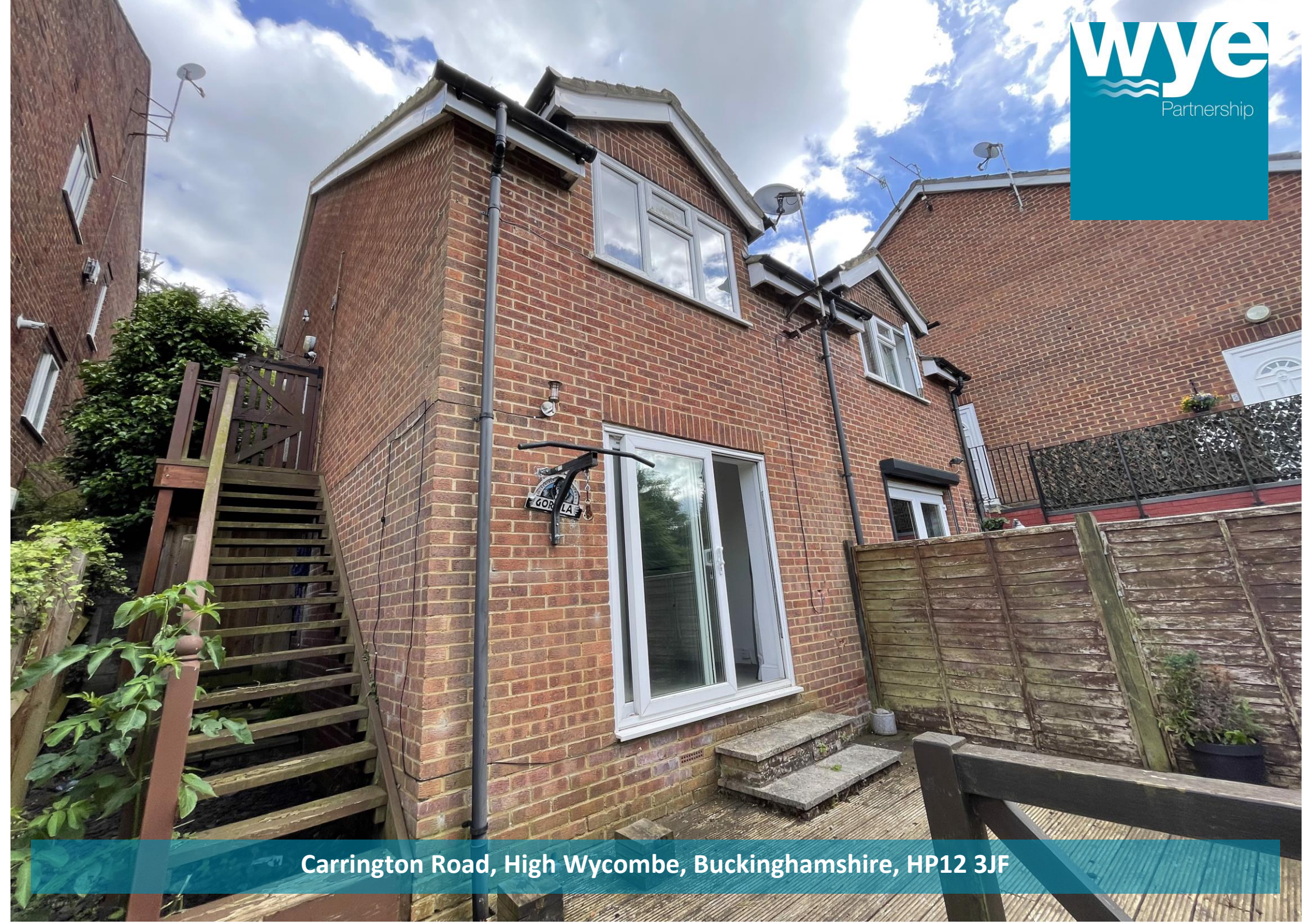
Carrington Road, High Wycombe, Buckinghamshire, HP12 3JF