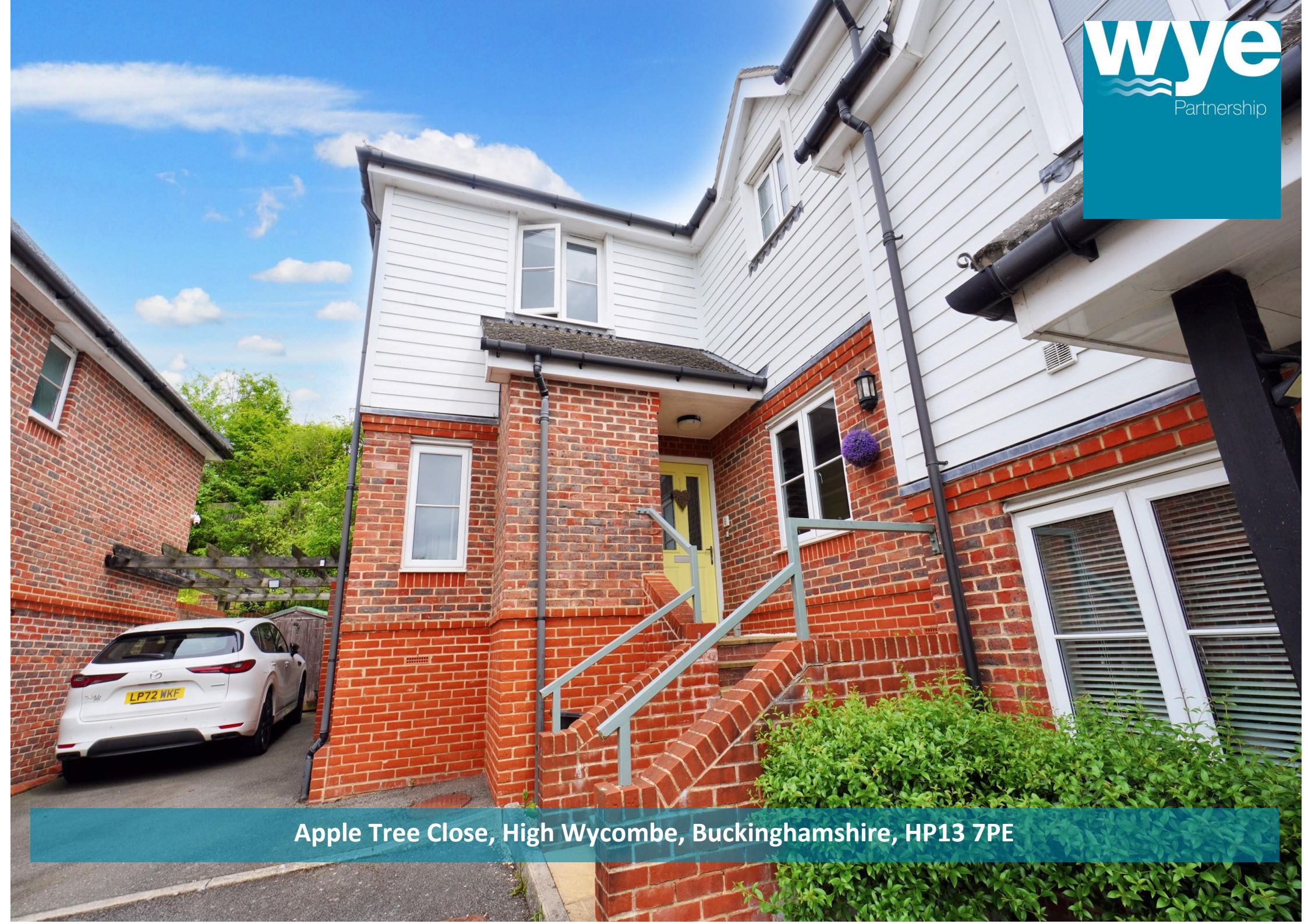
Apple Tree Close, High Wycombe, Buckinghamshire, HP13 7PE