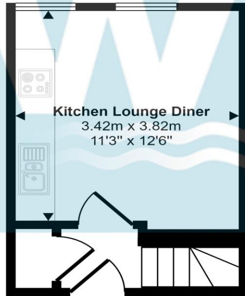
Ground Floor Approx 17 sq m / 185 sq ft

Approx Gross Internal Area 37 sq m / 395 sq ft