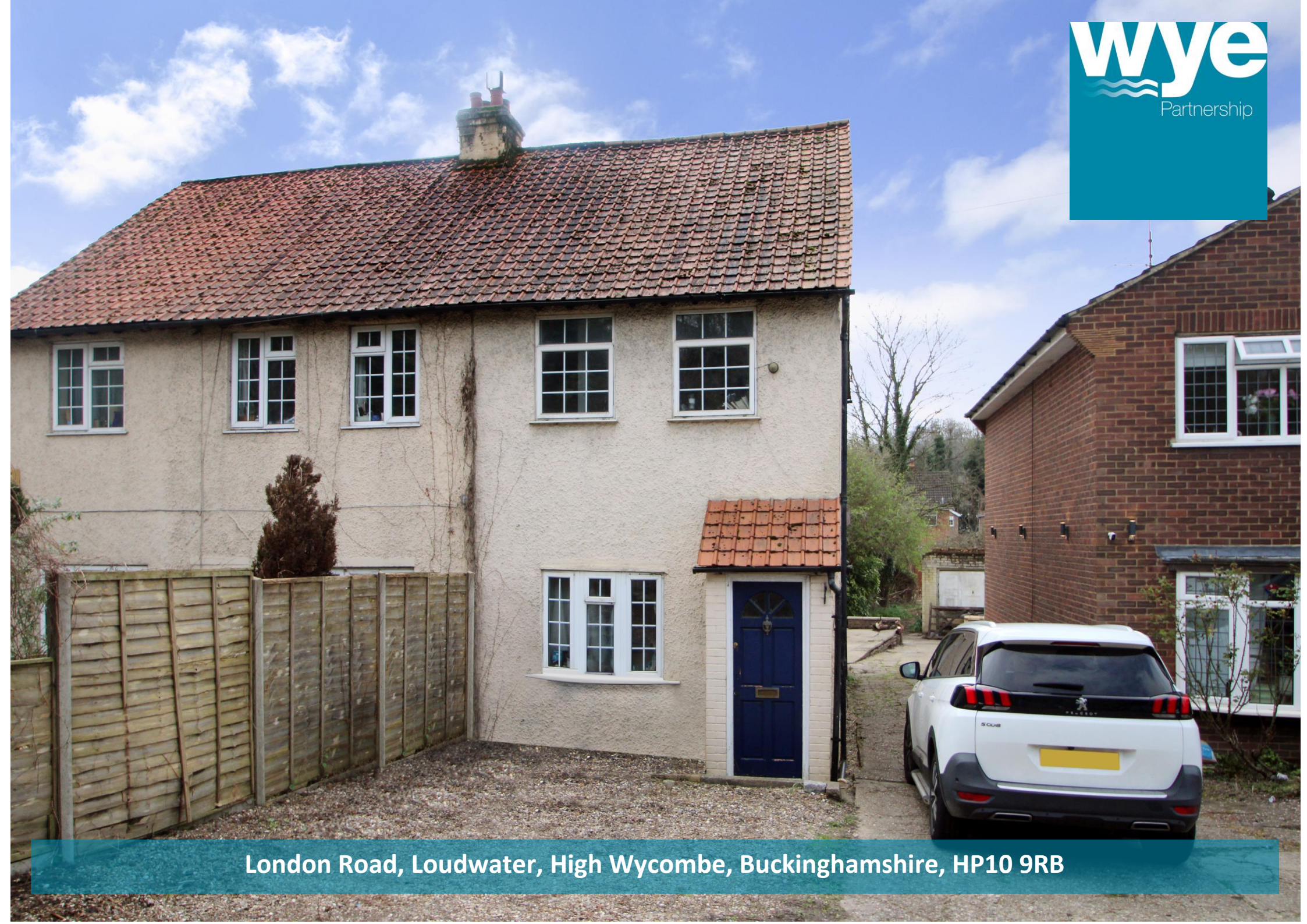
London Road, Loudwater, High Wycombe, Buckinghamshire, HP10 9RB