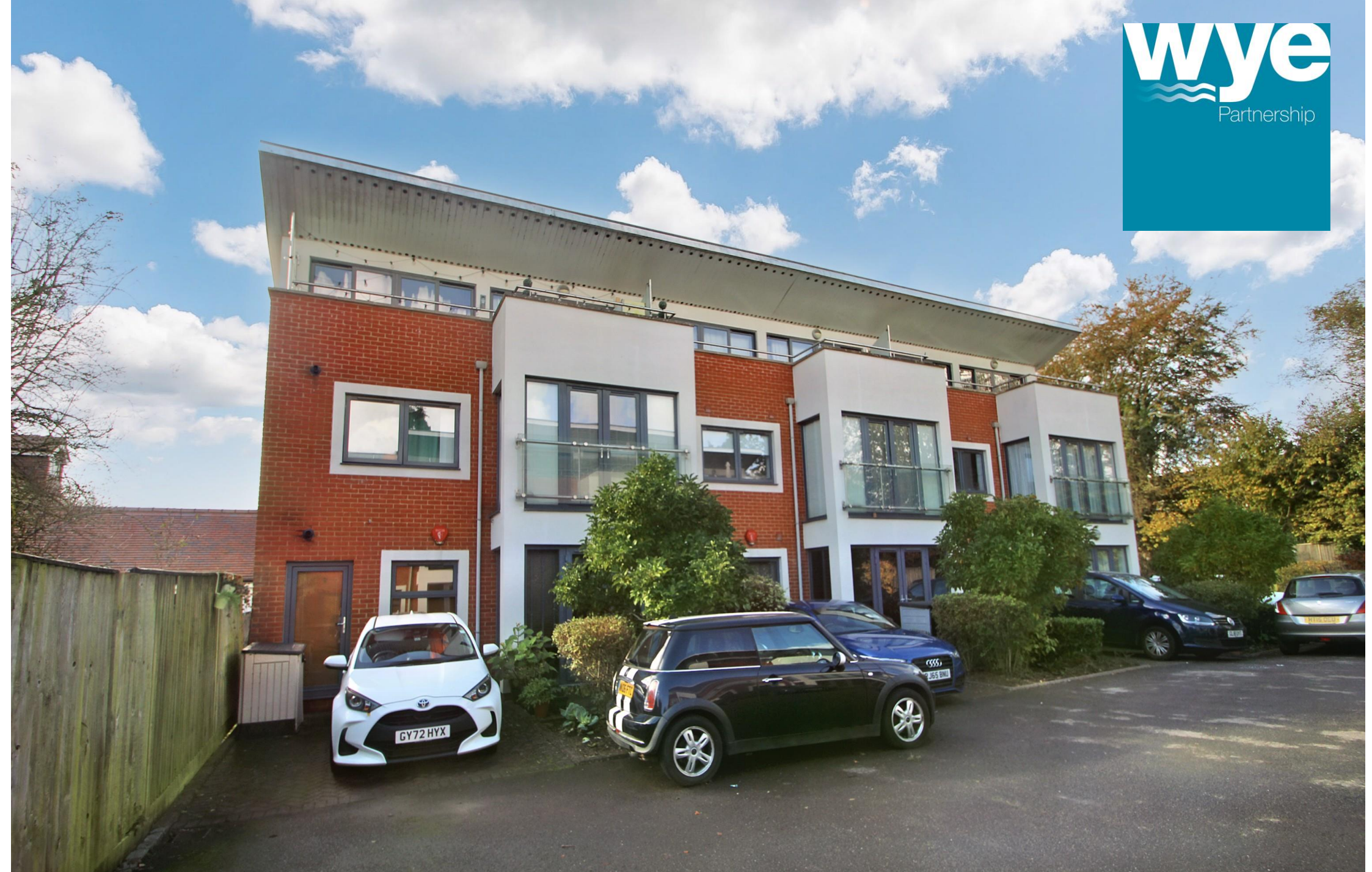
Skyline Mews, High Wycombe, Buckinghamshire, HP12 4FE