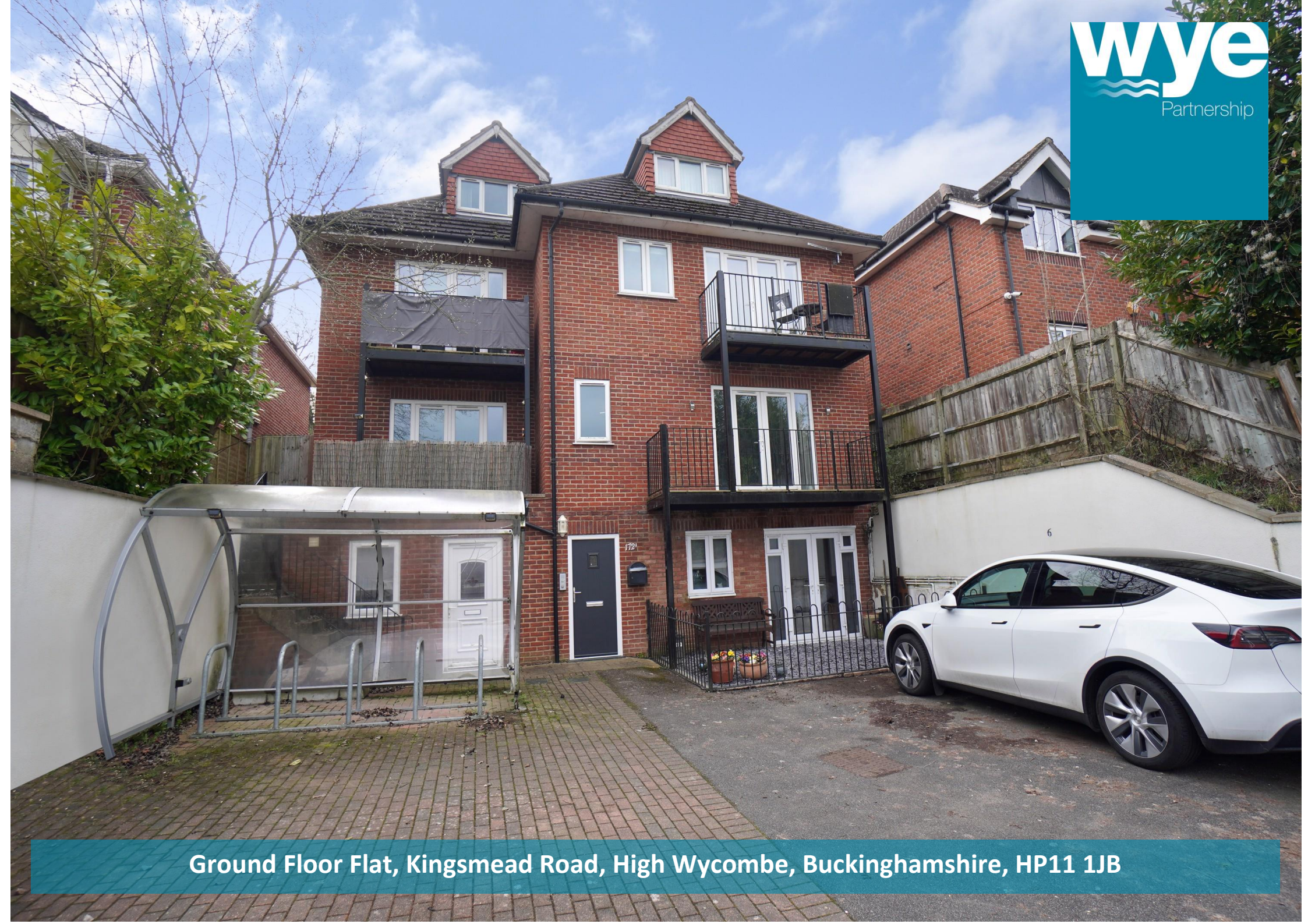
Ground Floor Flat, Kingsmead Road, High Wycombe, Buckinghamshire, HP11 1JB