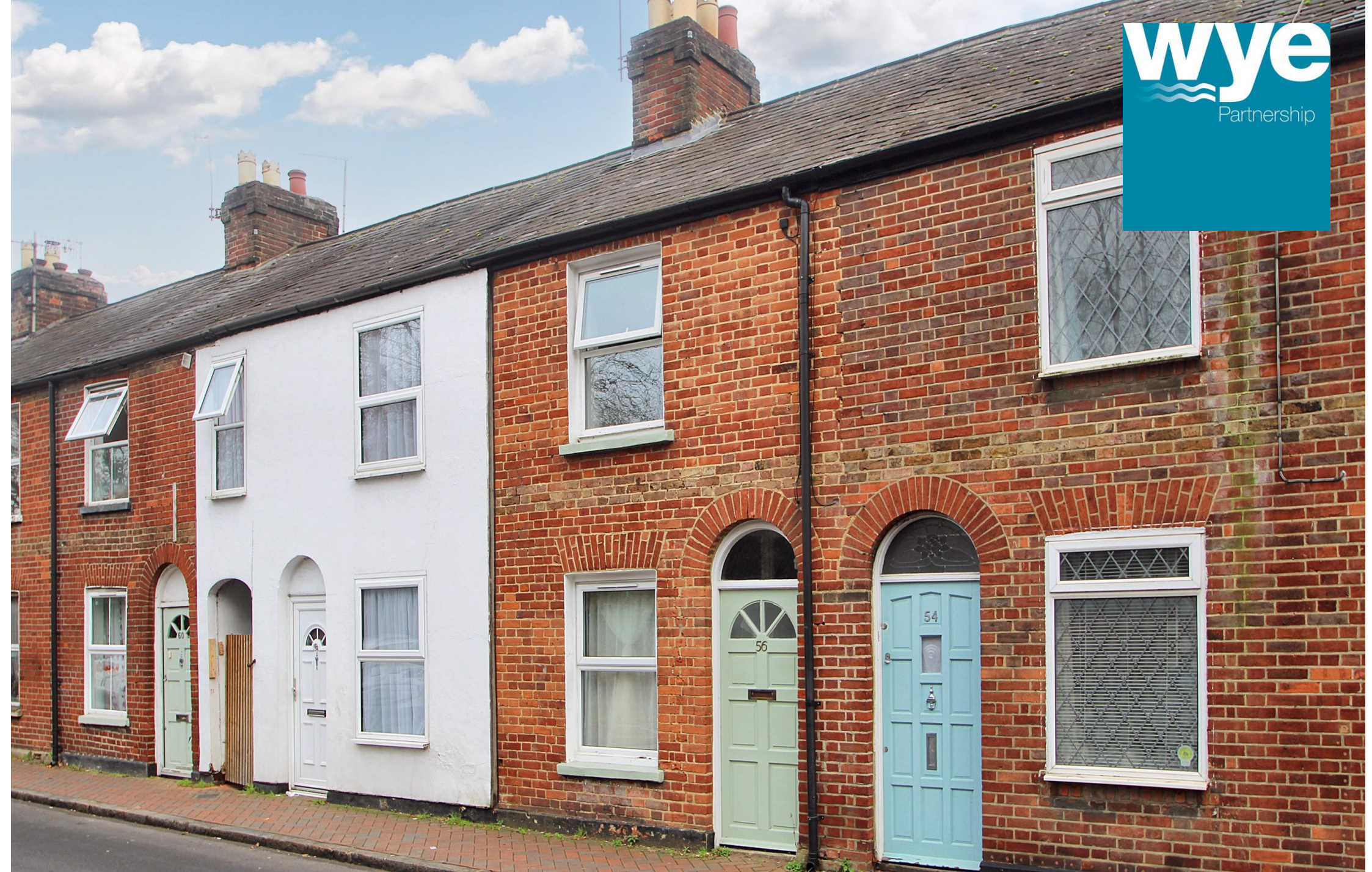
Temple End, High Wycombe, Buckinghamshire, HP13 5DS