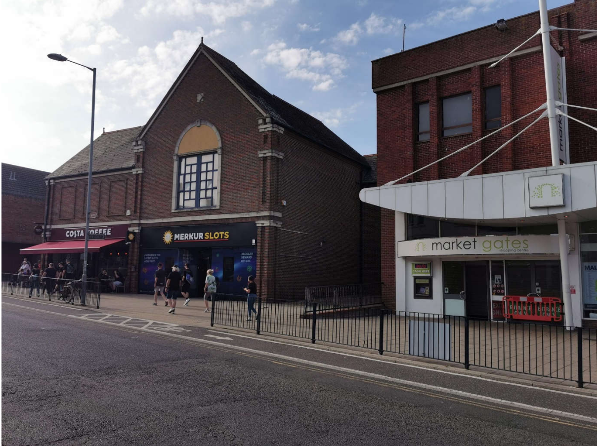
Opposite Market Gates Entrance