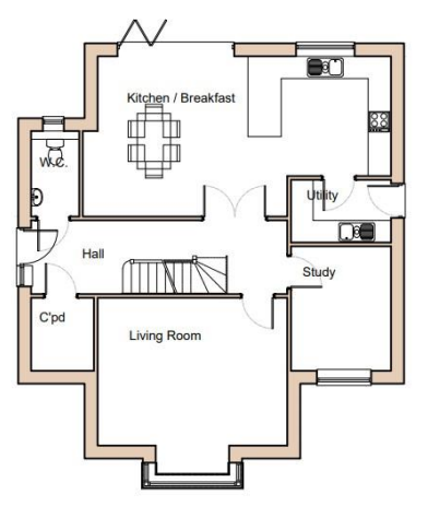
Ground Floor Plan 91.37 sq m - 983 sq ft Total Floor Area- 171.59 sq m - 1847 sq ft

described as rectangular, sloping gently from east to west. The new property will benefit from two parking spaces, a wrap-around garden and impressive views over agricultural fields.