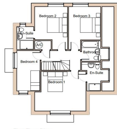
First Floor Plan 80.22 sq m - 863 sq ft