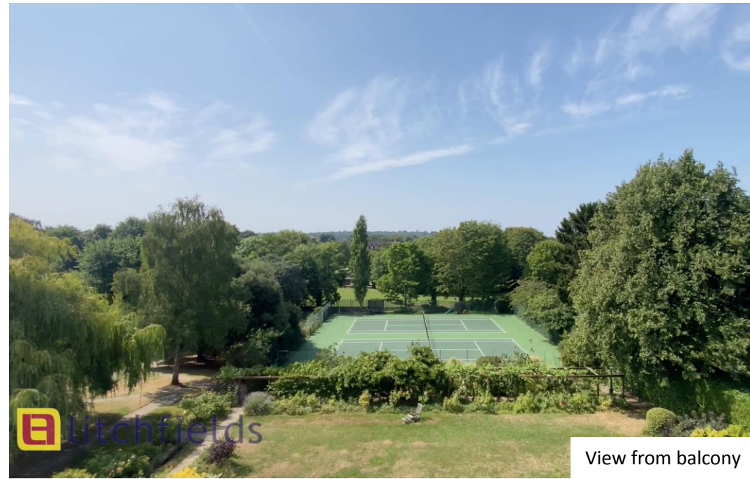
View from balcony