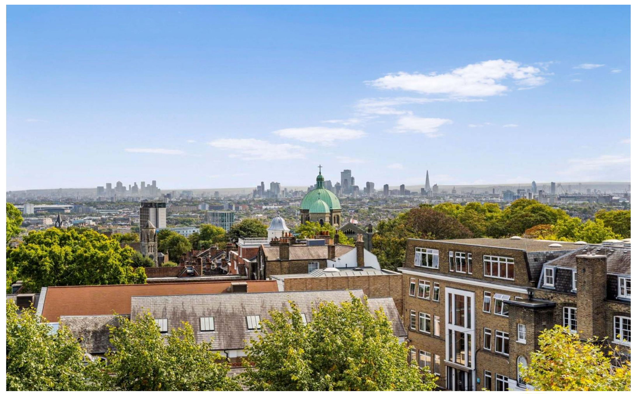
Cholmeley Lodge, Highgate, N6 £1,375,000 Share of Freehold