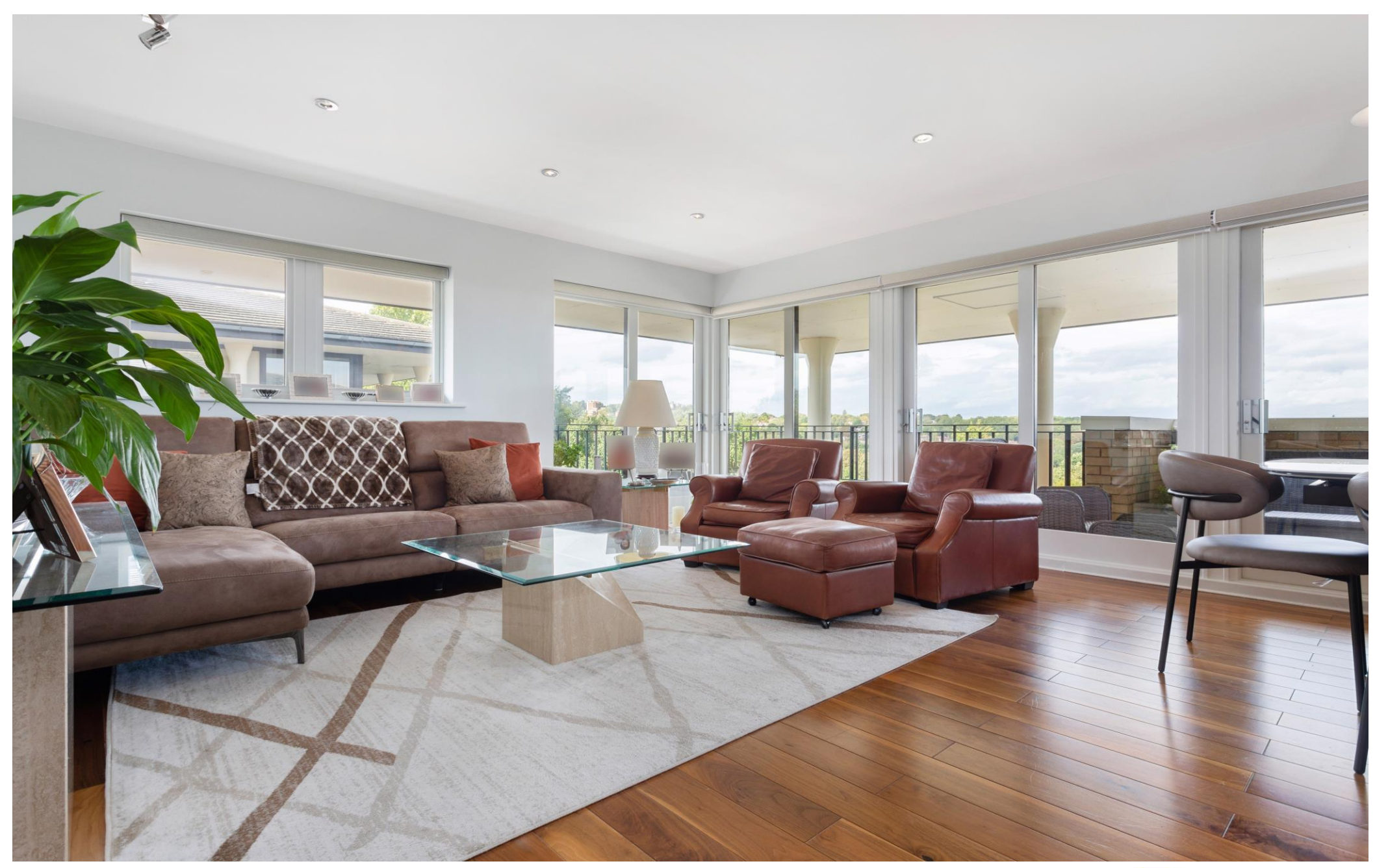
Ridgeway Gardens, Highgate Village, N6 £1,500,000 Share of Freehold