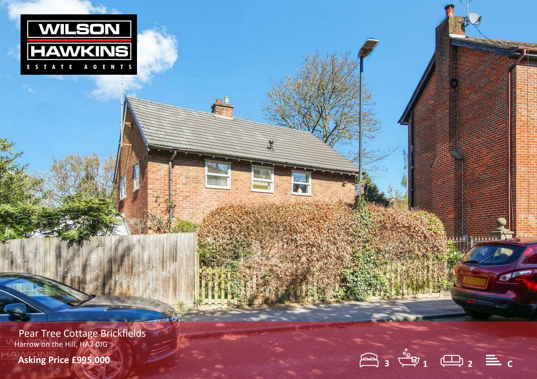
Pear Tree Cottage Brickfields Harrow on the Hill, HA2 0JG