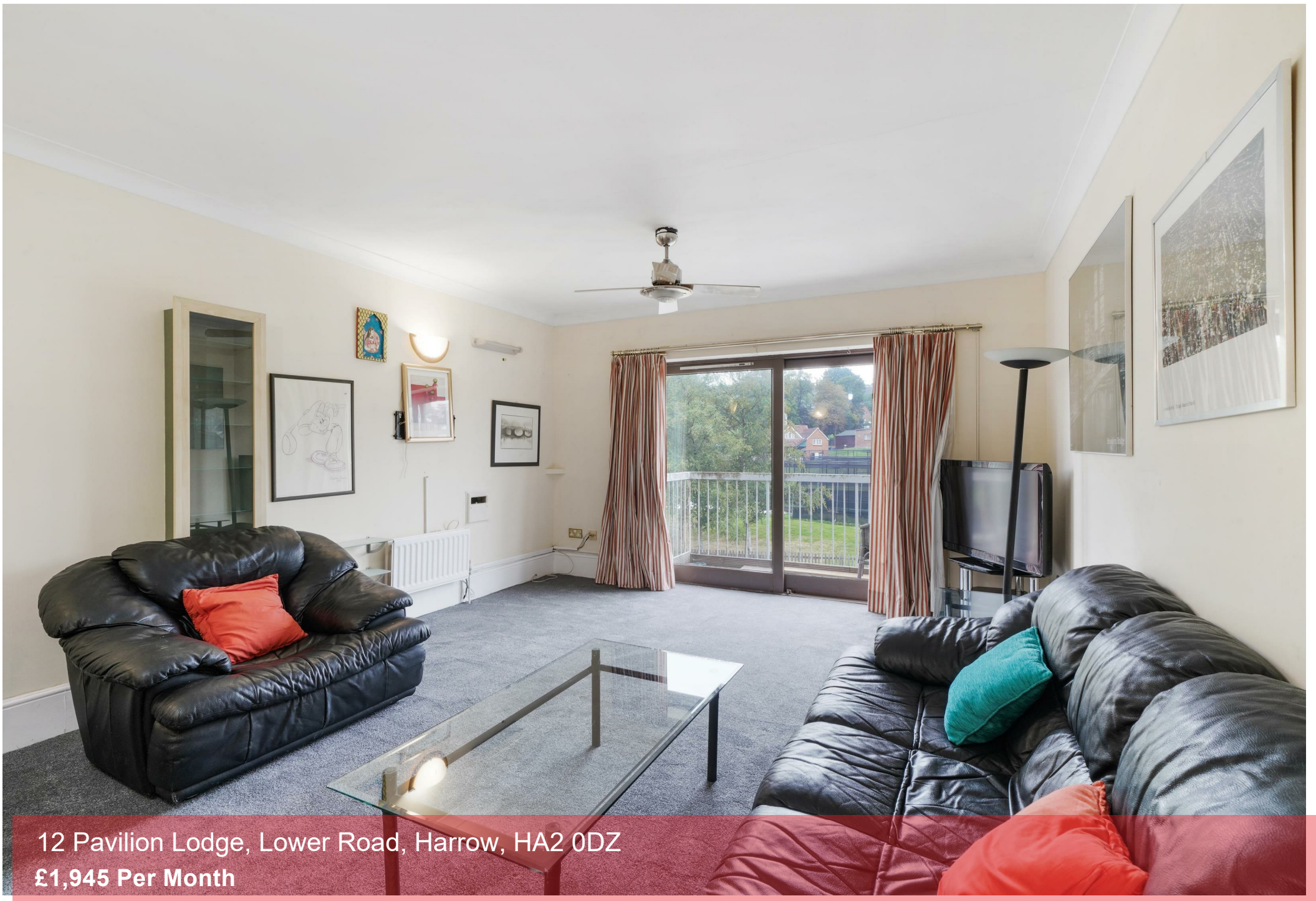
12 Pavilion Lodge, Lower Road, Harrow, HA2 0DZ £1,945 Per Month