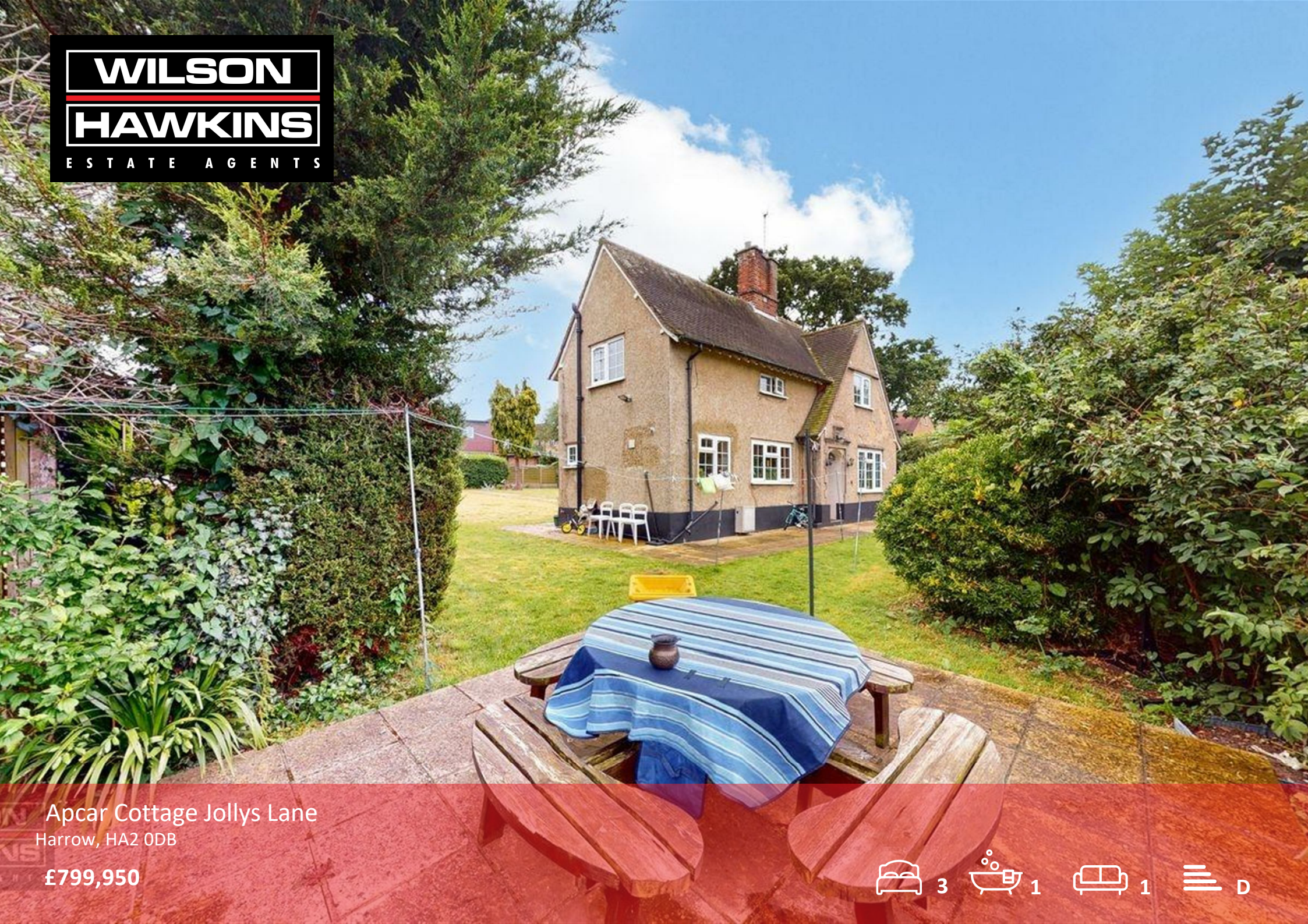
Apcar Cottage Jollys Lane Harrow, HA2 0DB