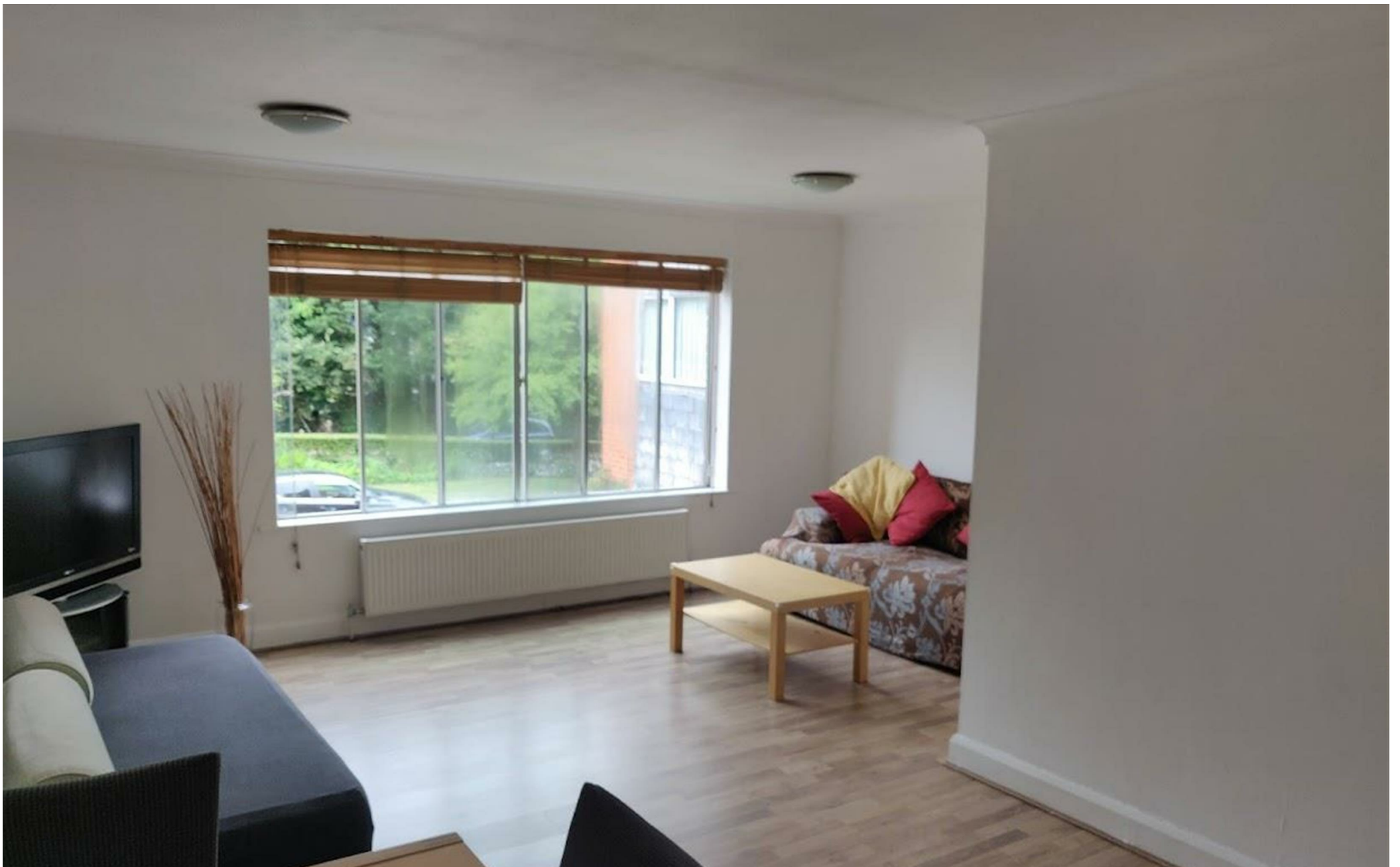
Flat 9, Sheridan Place 15 Roxborough Park, Harrow, HA1 3BQ £1,895 Per Month