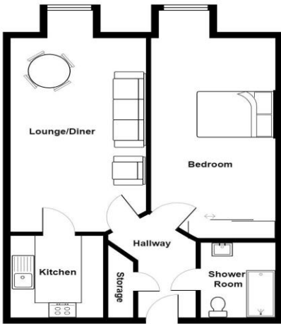
All measurements are approximate and for display purposes only Total Area: 561 ft 2