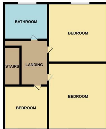
1ST FLOOR 407 sq.ft. (37.8 sq.m.) approx.