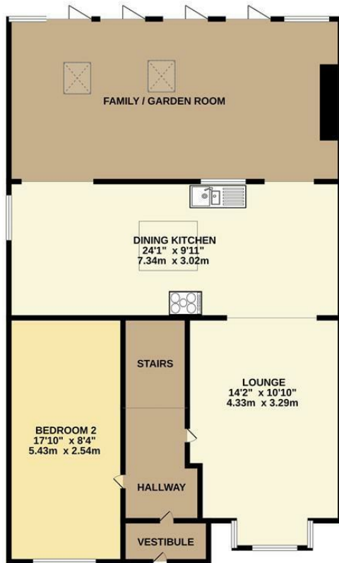
GROUND FLOOR 939 sq.ft. (87.2 sq.m.) approx.