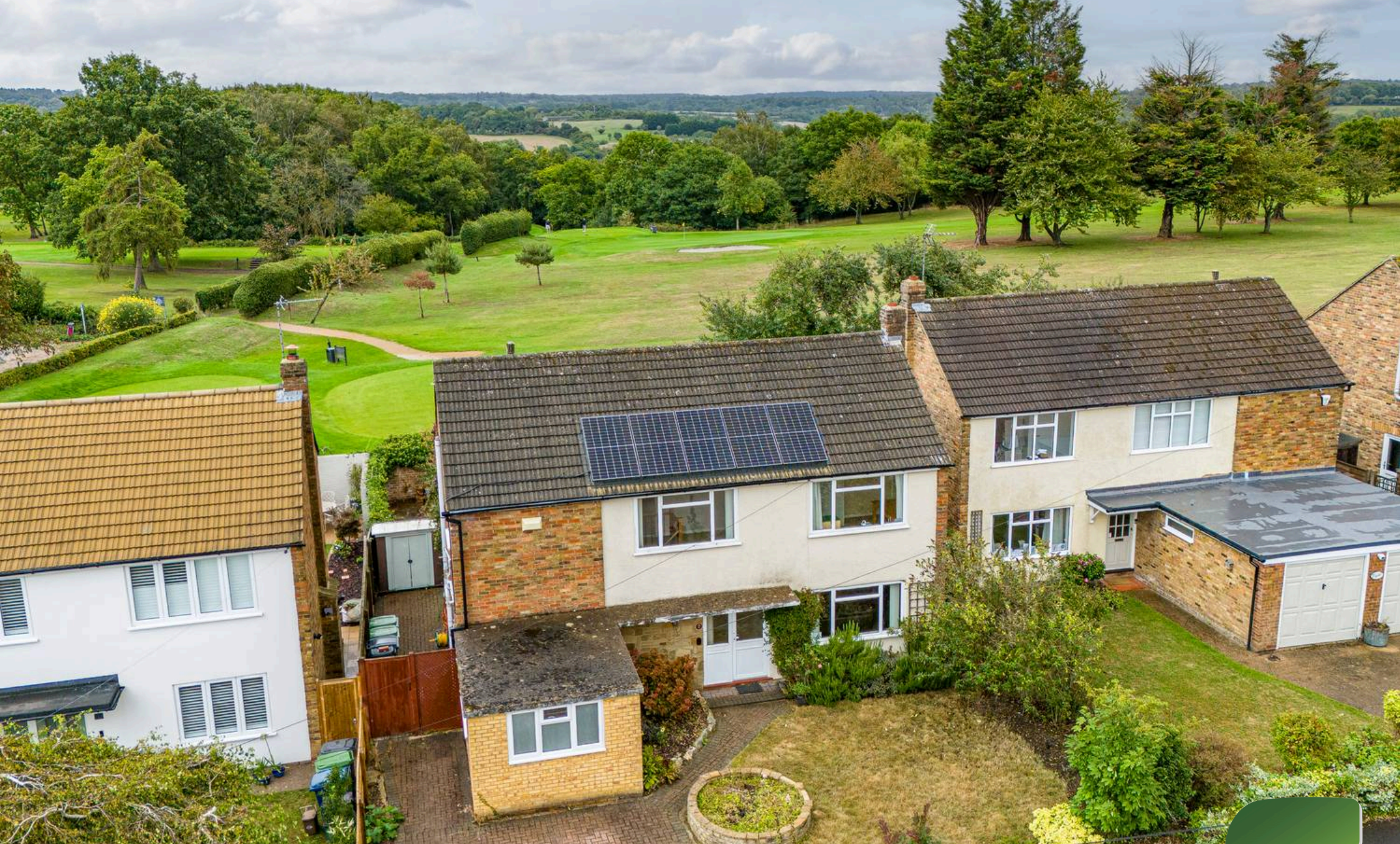
7 The Fairway, Flackwell Heath £700,000