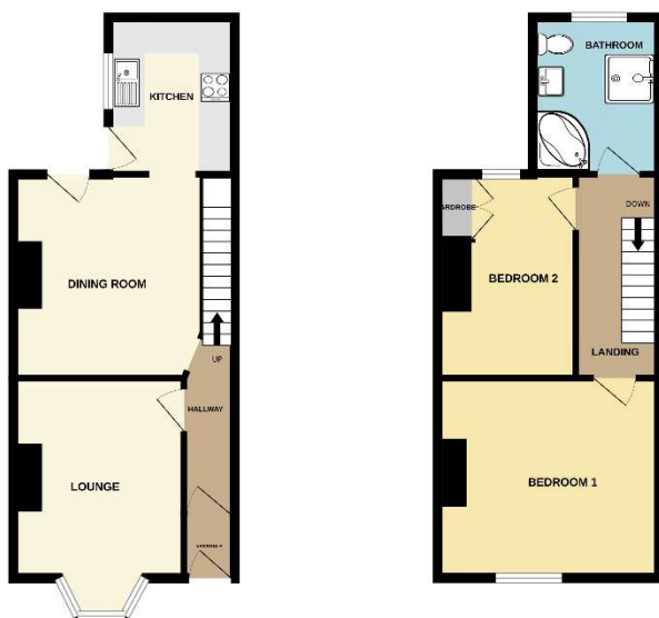
1ST FLOOR 369 sq.ft. (34.0 sq.m.) approx.

TOTAL FLOOR AREA: 1248 sq.ft. (115.2 sq.m.) approx.