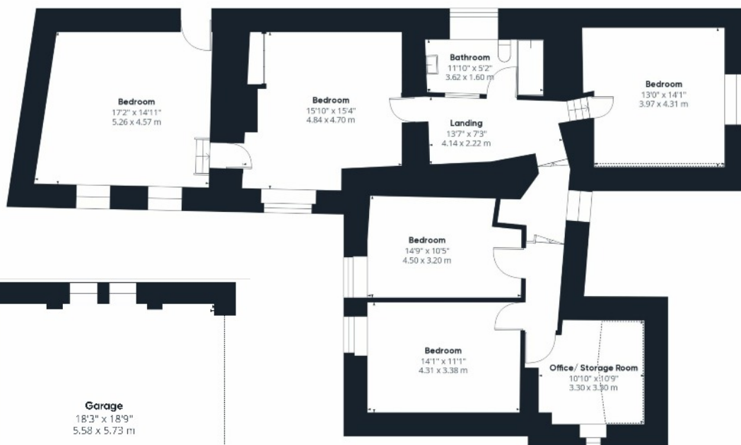
Floor 1 Building 1

Approximate total area (1) 2651.7 ft 2 246.35 m 2