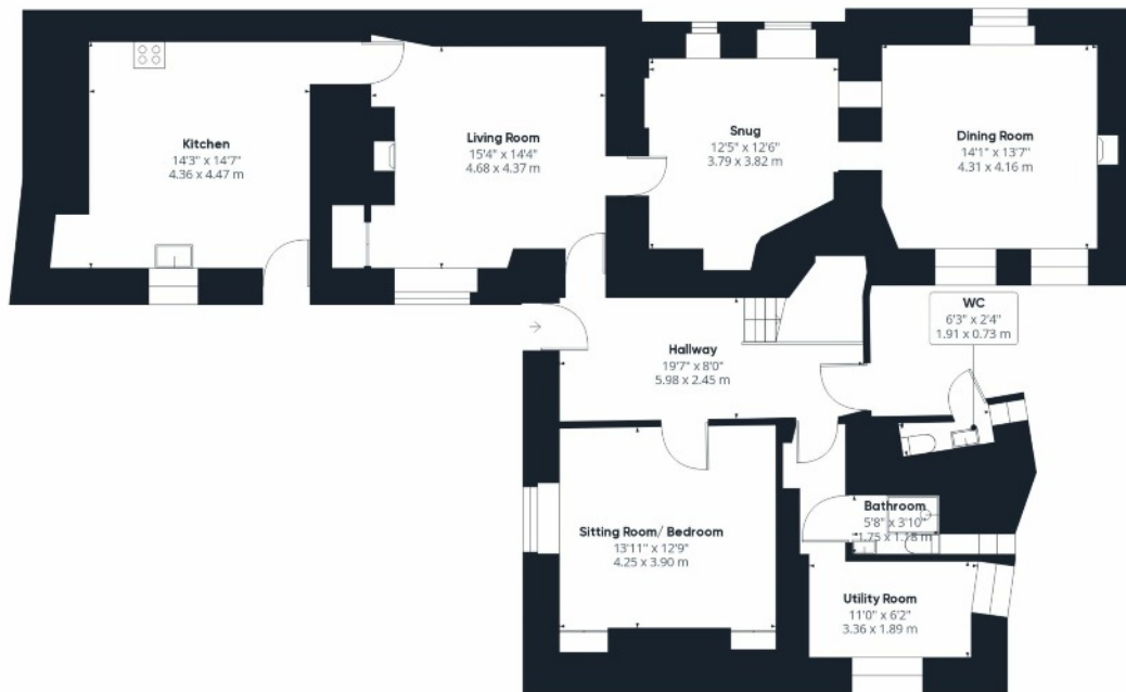
Floor 0 Building 1