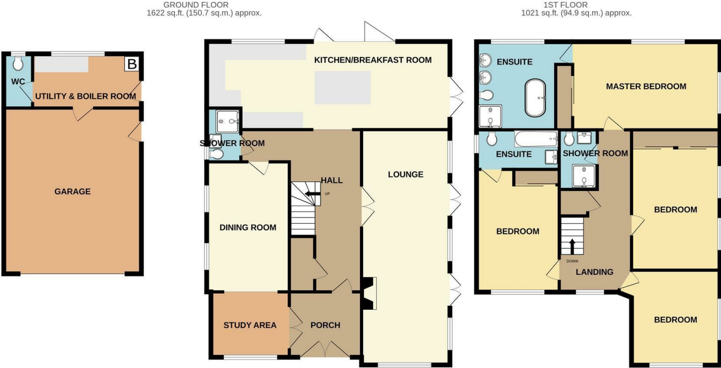
GROUND FLOOR 1622 sq.ft. (150.7 sq.m.) approx.

The same also applies if we have introduced you to the services of our panel of surveyors who we are confident will provide you with a first class service relevant to your property needs. We will again receive a referral fee equivalent to 10% of the fee that you pay capped at £200.00 This referral fee does not impact the actual fee that you would pay had you approached any of the panel of surveyors directly as it is paid to us as an intermediary on the basis that we save them significant marketing expenditure in so doing. If you have any queries regarding the above, please feel free to contact us.